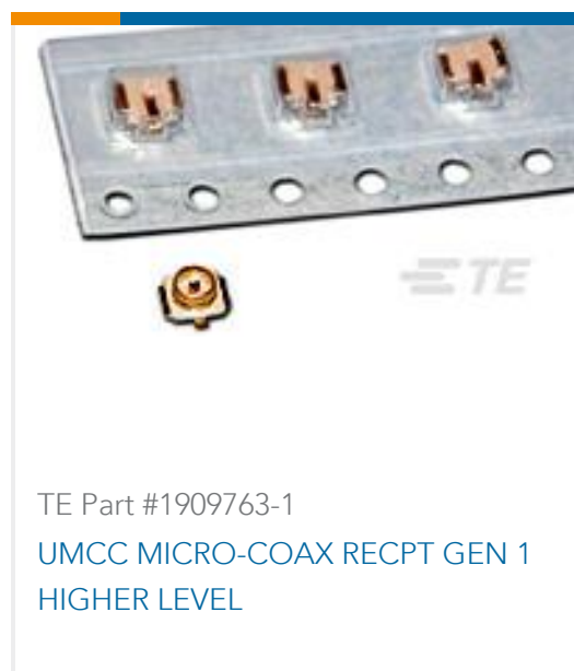
TE Part #1909763-1 UMCC MICRO-COAX RECPT GEN 1 HIGHER LEVEL