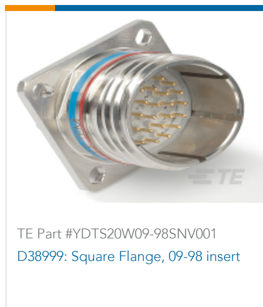
TE Part #YDTS20W09-98SNV001 D38999: Square Flange, 09-98 insert