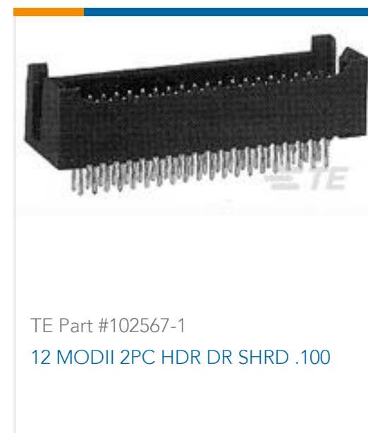
TE Part #102567-1 12 MODII 2PC HDR DR SHRD .100