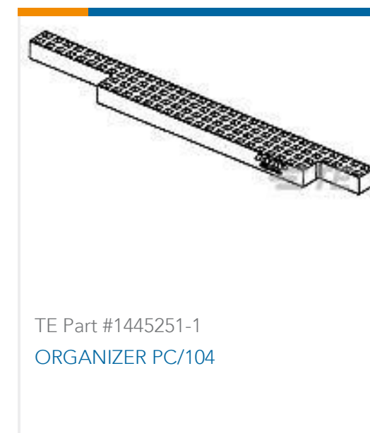
TE Part #1445251-1 ORGANIZER PC/104