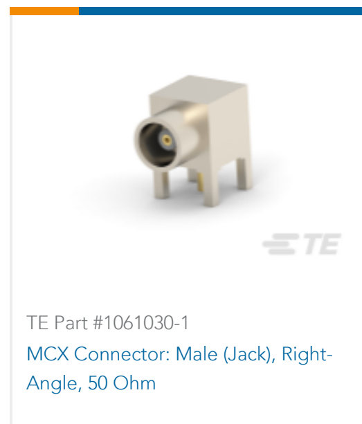
TE Part #1061030-1 MCX Connector: Male (Jack), Right- Angle, 50 Ohm