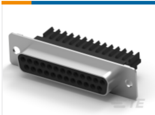
TE Part #1-745495-8 IDC D-Sub: Receptacle Assembly, Wire to Wire, Signal, 2.77 mm