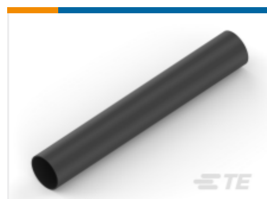
TE Part #EM7480-000 X2-1.5-0-SP-SM