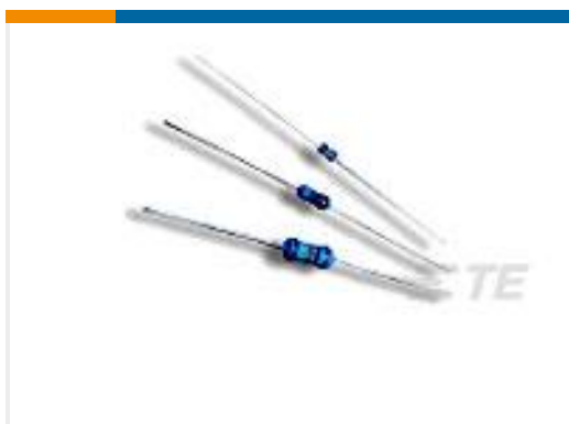
TE Part #1-1676913-1 YR1 0.1% 1K3