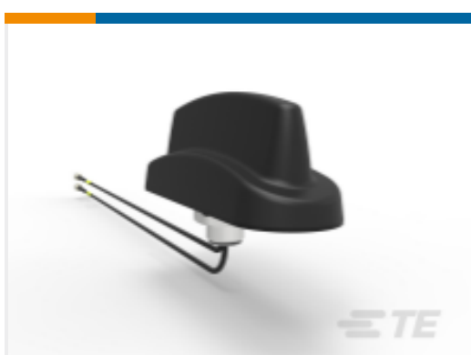
TE Part #1-2309605-1 M2M/IOT MIMO LTE ANTENNA