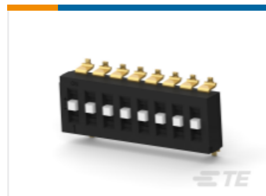
TE Part #1-2319747-8 TRI-STATE DIP 8P G RAISED T&R