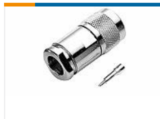
TE Part #1-1478419-0 N Str Plg PS 50Ohm Silver Pltd RG58C /U,