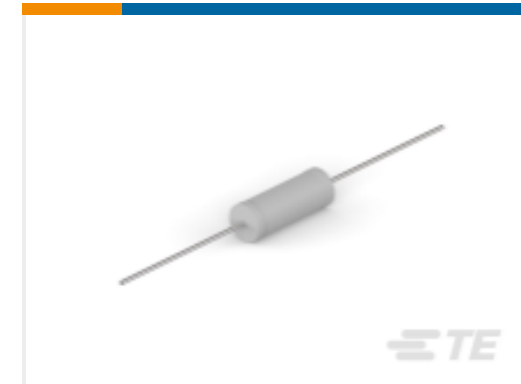
TE Part #1-2176412-9 5W XSM M/OX 5% 30R