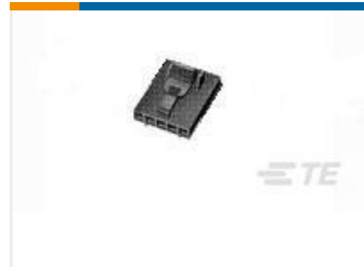
TE Part #104257-4 05 MTE RCPT HSG SR LATCH .100