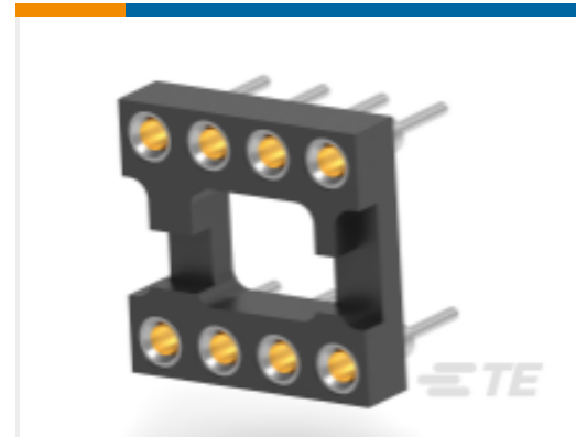
TE Part #1-2199299-2 DIP Socket: Standard, Stamped & Formed, Open, Tin