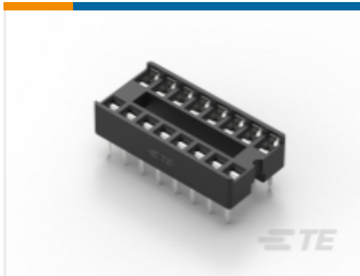
TE Part #1-2199298-6 DIP Socket: Low Profile, Stamped & Formed, Open, Tin