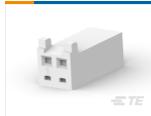
TE Part #1375820-4 Receptacle Housing: 2.54mm, 1 Row, CST-100 II