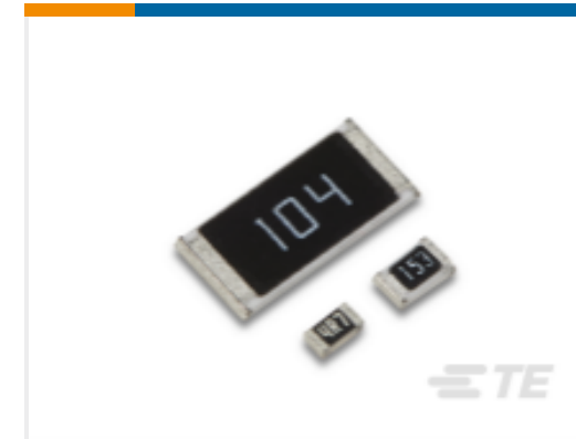
TE Part #1-2176349-9 CRGCO 2512 330R 1%