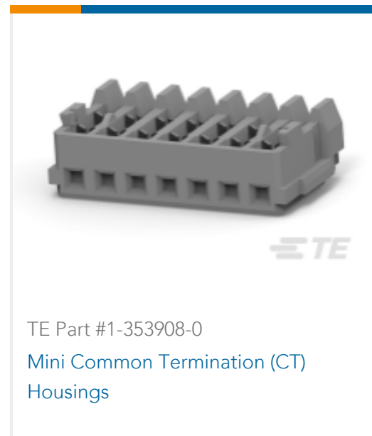
TE Part #1-353908-0 Mini Common Termination (CT) Housings