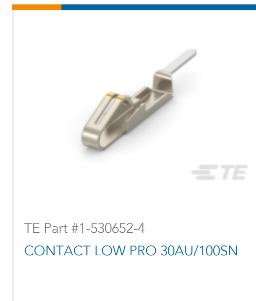
TE Part #1-530652-4 CONTACT LOW PRO 30AU/100SN