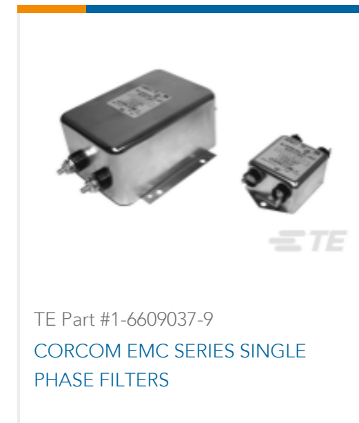
TE Part #1-6609037-9 CORCOM EMC SERIES SINGLE PHASE FILTERS