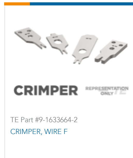
TE Part #9-1633664-2 CRIMPER, WIRE F