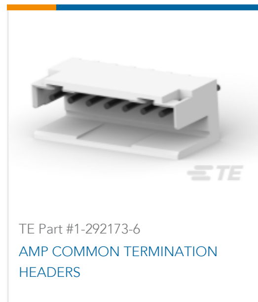
TE Part #1-292173-6 AMP COMMON TERMINATION HEADERS