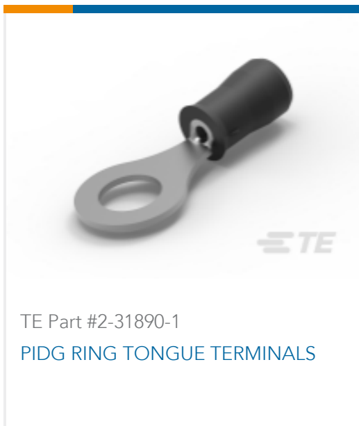
TE Part #2-31890-1 PIDG RING TONGUE TERMINALS