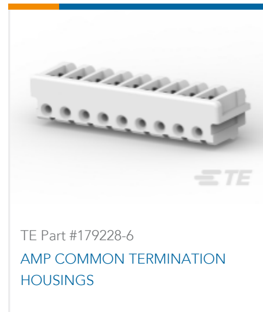
TE Part #179228-6 AMP COMMON TERMINATION HOUSINGS