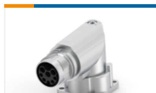
TE Part #BGC880N0000052A000 917 RECEPTACLE, ANGLED, ROTATABLE