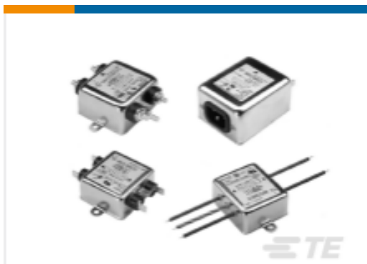
TE Part #1-6609028-2 CORCOM K SERIES SINGLE PHASE FILTERS