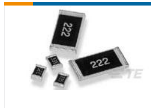
TE Part #1623100-1 CRG0805 1% 10R