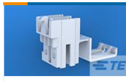
TE Part #1703073-1 2POS MT-EDGE HOUSING