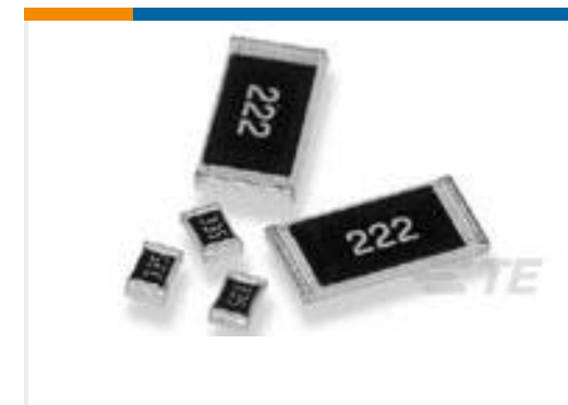
TE Part #1623214-1 CRG0805 1% 3K3