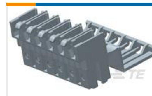
TE Part #1703111-1 6POS MT - EDGE HOUSING