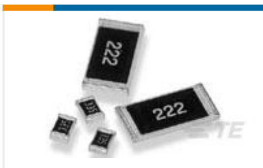
TE Part #1623108-1 CRG0805 1% 12K