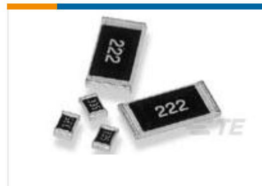
TE Part #1623693-1 CRG1206 ZEROHM