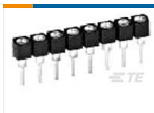
TE Part #3-1437535-1 510-AG91D-20=INLINE SOCKET ASS