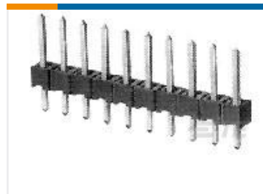
TE Part #2-825433-2 MOD 2 PINHDR 1X22P.