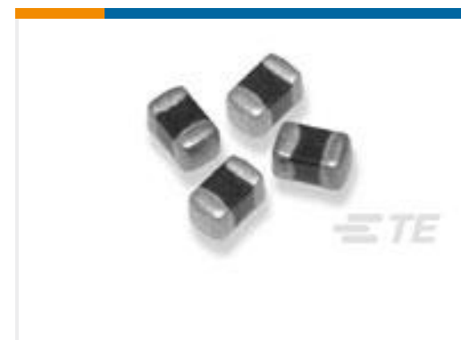
TE Part #3-1624117-2 BMB-A 0805 10R N8