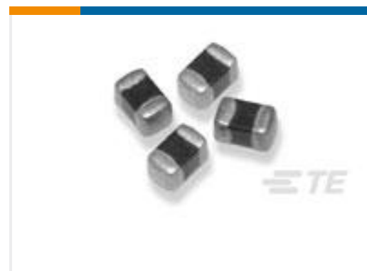
TE Part #2-1624116-5 BMB-A 0603 30R N8