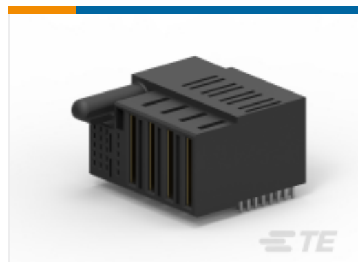
TE Part #2204416-1 MULTI-BEAM HD R/A.REC.4VP+20S SOLDER