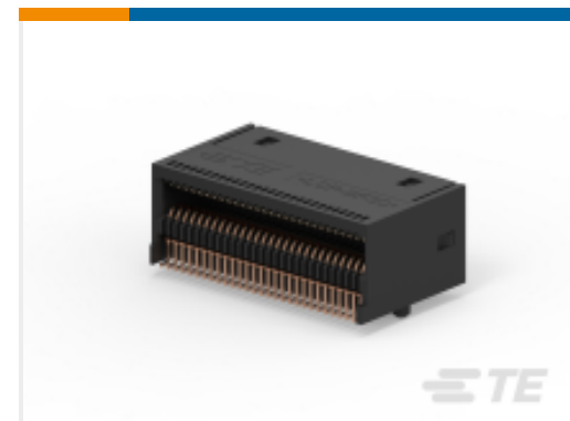
TE Part #2288229-1 CFP4 RECEPTACLE