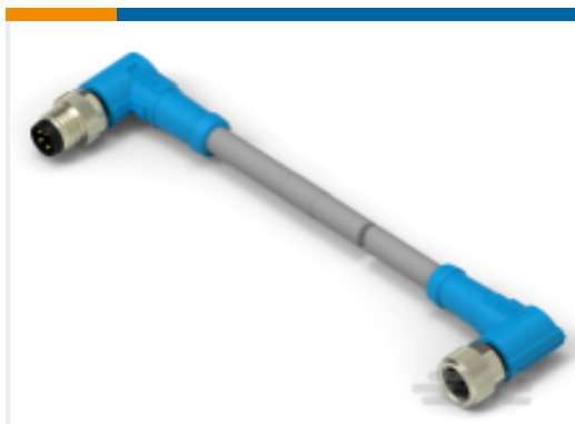
TE Part #T4052224003-001 M8 MR-FR DOUBLE ENDED CABLE