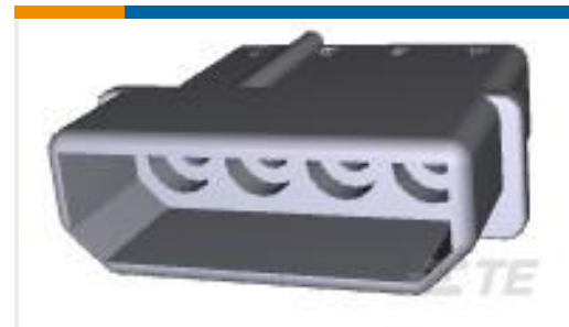
TE Part #1-480426-0 04P CMNL CAP HSG F/H NATL