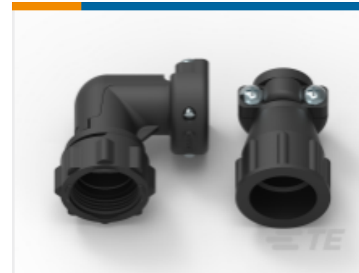
TE Part #206070-8 CPC CABLE CLAMPS