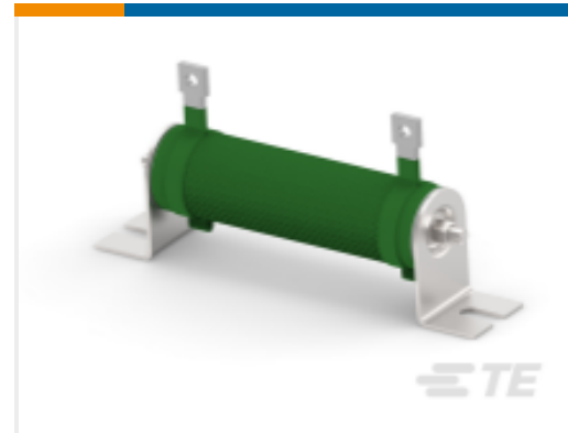
TE Part #1-1879451-6 Wirewound Resistor: Mineral, 2.5 Kw