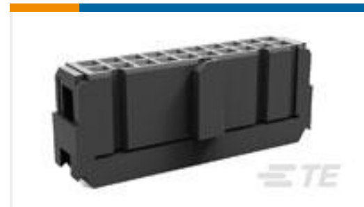
TE Part #1658621-8 34 NOVO MIL/CTR 15DP, LEAD FREE