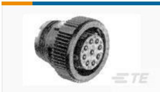
TE Part #205839-3 CPC PLUG ASSEMBLY SIZE 17-28