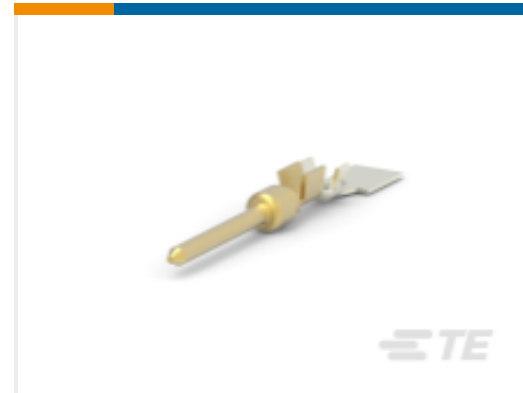
TE Part #66506-9 D-Sub Connector Contacts: Pin, Brass, Signal, Size 20