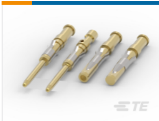
TE Part #201611-1 TYPE II CONTACTS