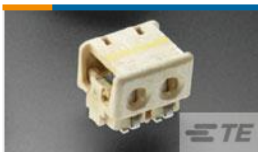
TE Part #2106431-1 Connector, SMT-IDC PASS THRU, 1 POS, 18