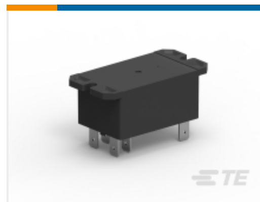
TE Part #4-1393211-6 PCB Power Relay: 40 Amp, Monostable