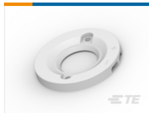
TE Part #2213382-2 Z50 ZHAGA PROFILE LED HOLDERS