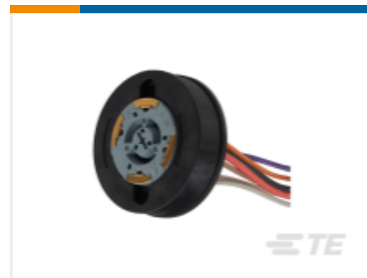
TE Part #2213627-2 DIMMING RECEPTACLE, ROTATABLE