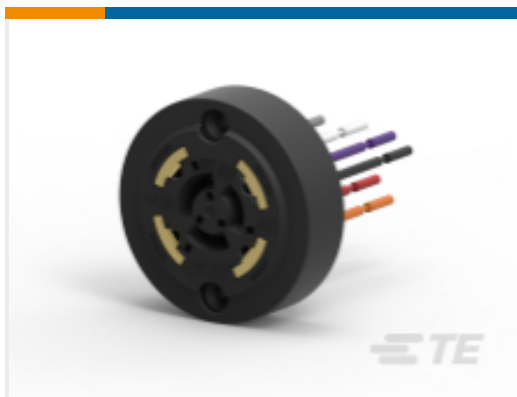
TE Part #2213362-3 DIMMING RECEPTACLE