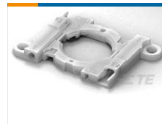
TE Part #2174024-1 LUMAWISE LED HOLDER, TYPE NL2