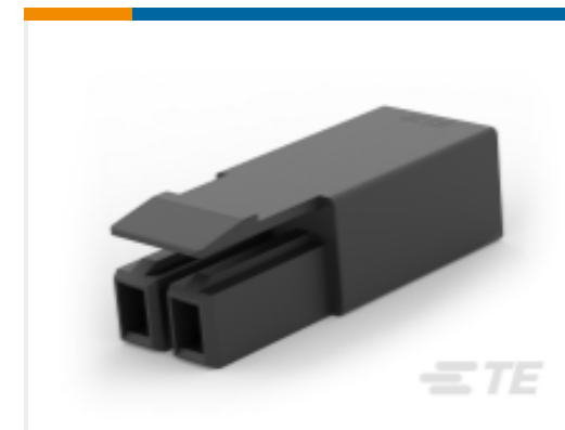
TE Part #2834048-4 LIGHT-N-LOK MODULAR LATCHED PLUGS