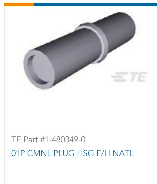
TE Part #1-480349-0 01P CMNL PLUG HSG F/H NATL