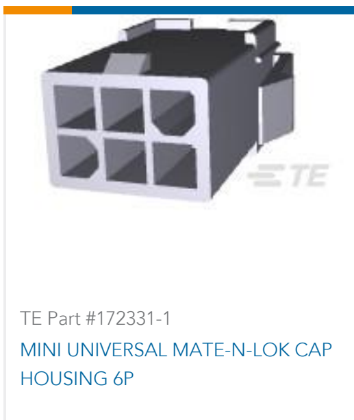
TE Part #172331-1 MINI UNIVERSAL MATE-N-LOK CAP HOUSING 6P