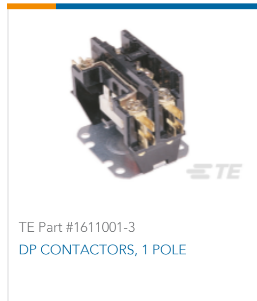
TE Part #1611001-3 DP CONTACTORS, 1 POLE