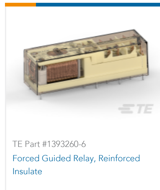
TE Part #1393260-6 Forced Guided Relay, Reinforced Insulate