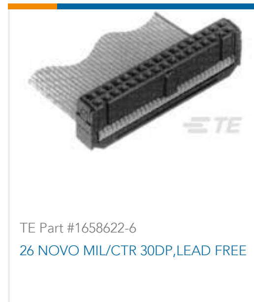
TE Part #1658622-6 26 NOVO MIL/CTR 30DP, LEAD FREE