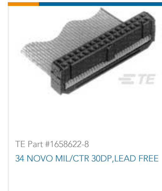
TE Part #1658622-8 34 NOVO MIL/CTR 30DP, LEAD FREE