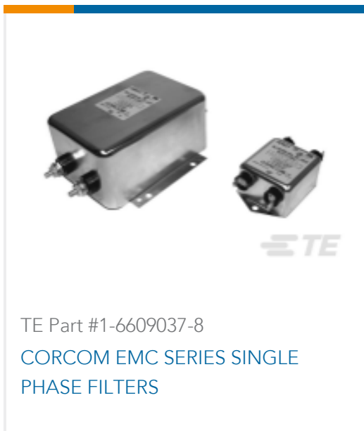
TE Part #1-6609037-8 CORCOM EMC SERIES SINGLE PHASE FILTERS