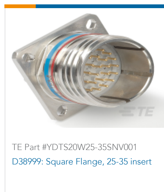
TE Part #YDTS20W25-35SNV001 D38999: Square Flange, 25-35 insert