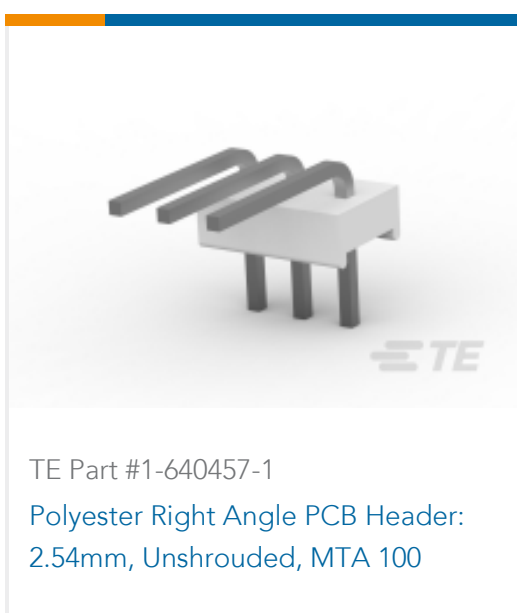
TE Part #1-640457-1 Polyester Right Angle PCB Header: 2.54mm, Unshrouded, MTA 100