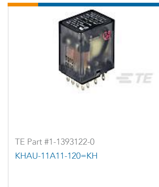
TE Part #1-1393122-0 KHAU-11A11-120=KH