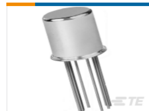
TE Part #1-1617118-3 J1MACD-12XLS = M39016/23-034L