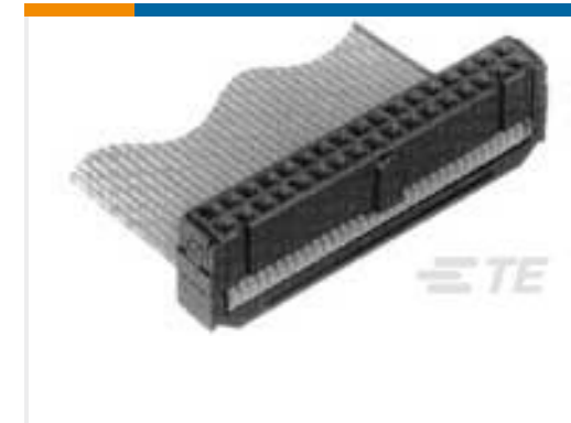
TE Part #1658622-8 34 NOVO MIL/CTR 30DP, LEAD FREE