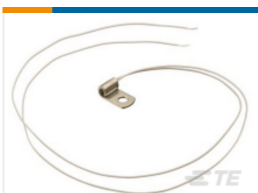
TE Part #GA10K4D25 PRO2-PROBE