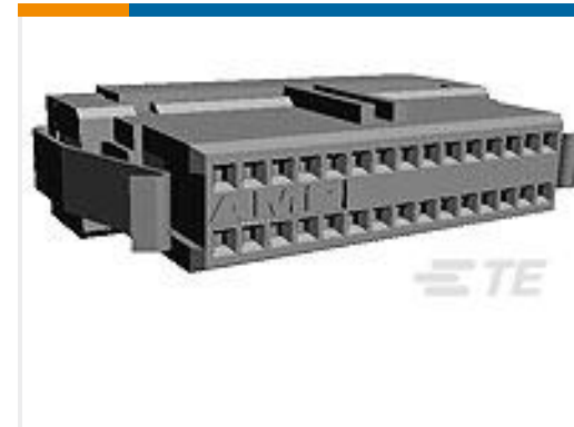
TE Part #2-111196-1 50 RCPT SYSTEM 50, LEAD FREE