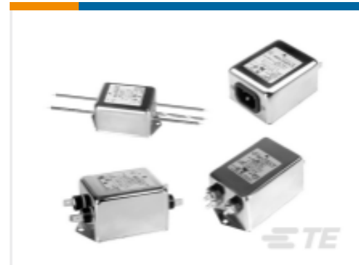
TE Part #1-6609032-0 CORCOM R SERIES SINGLE PHASE FILTERS