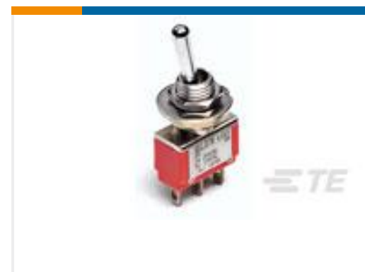
TE Part #1-1825136-5 A101MD9AV2B04