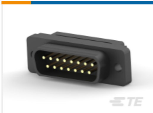
TE Part #1658608-1 IDC D-Sub: Plug Assembly, Low Profile, Signal, 2.77 mm