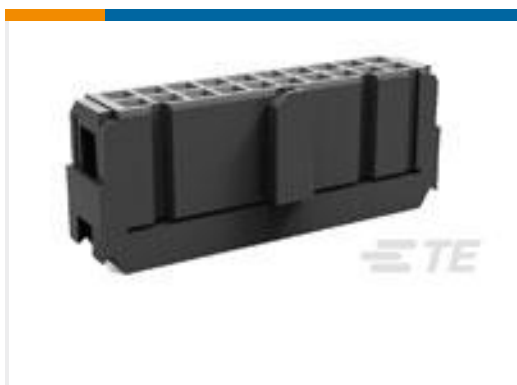
TE Part #1658621-7 30 NOVO MIL/CTR 15DP, LEAD FREE