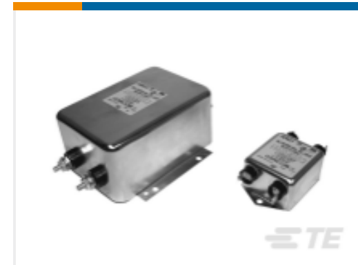
TE Part #1-6609037-9 CORCOM EMC SERIES SINGLE PHASE FILTERS