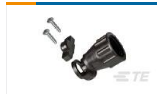
TE Part #1-206062-6 CABLE CLAMP KIT #11