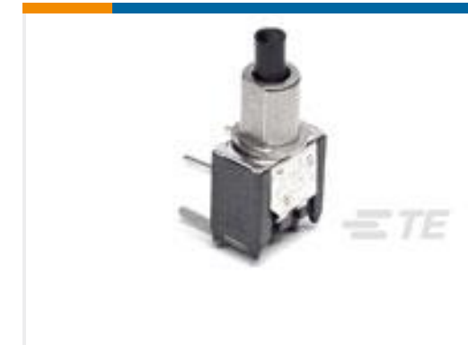
TE Part #1-1825097-6 TPB11FGVRA004