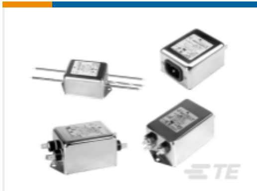
TE Part #1-6609032-8 CORCOM R SERIES SINGLE PHASE FILTERS