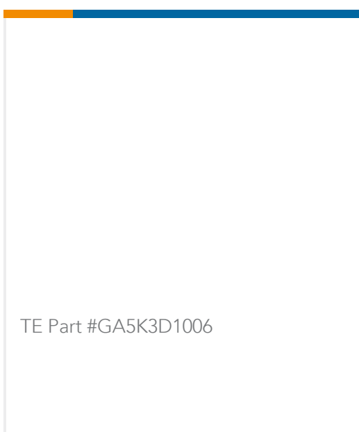
TE Part #GA5K3D1006