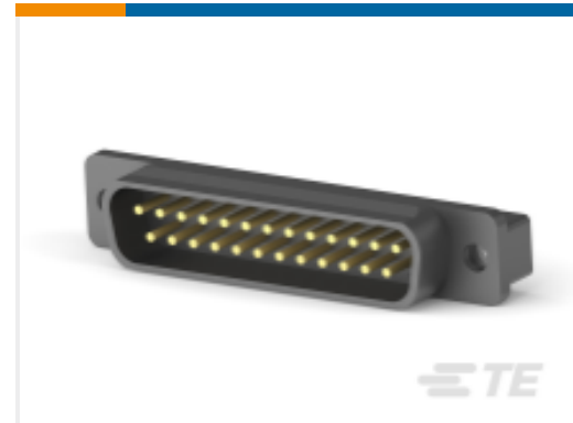
TE Part #1-5745968-4 D-Sub Plug Assembly: Vertical, Shell Size 3, 2.74mm