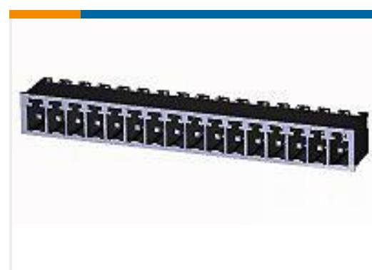
TE Part #1-284514-0 10 POS TERMI-BLOK HDR DIR. POL