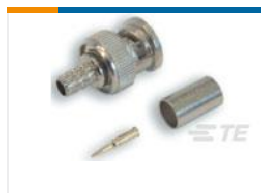
TE Part #5-1634500-0 BNC Str Plg Hex 50Ohm Nickel Plated RG17