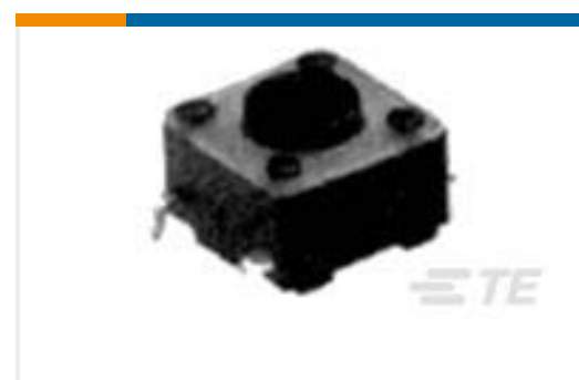
TE Part #4-1437565-2 FSM4JSMATR=TACT SWITCH 6X6MIL