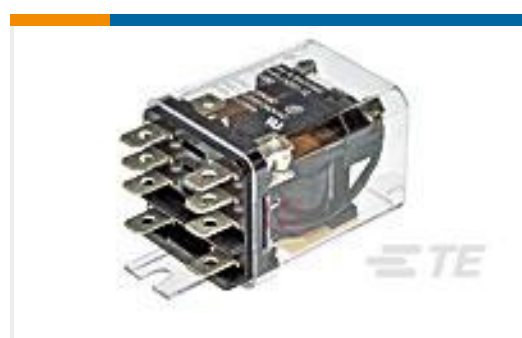
TE Part #7-1393114-8 KUHP-11D51-24=KU