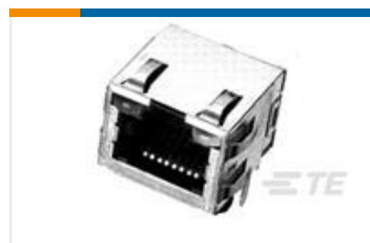
TE Part #6116075-1 INV MJ,1X1,SHIELDED,LED (G/Y)