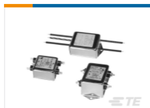
TE Part #6609034-1 CORCOM DK SERIES SINGLE PHASE FILTERS