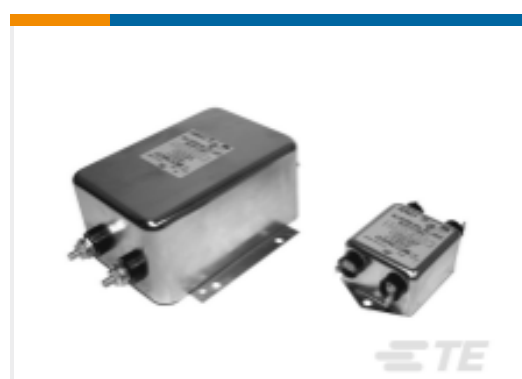
TE Part #1-6609037-2 CORCOM EMC SERIES SINGLE PHASE FILTERS