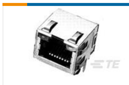
TE Part #1-406507-4 IMJ,1X1,P GRD,INSLT,LED(Y/G)SN