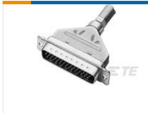
TE Part #5748472-1 KIT,PLUG,78P,HDP-22,SHLD HDWRE