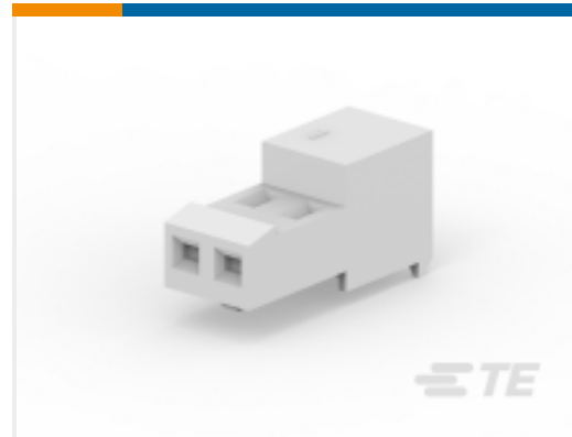
TE Part #3-644575-5 Nylon Tin Plated Receptacle: 2.54mm, No Mating Alignment, MTA 100