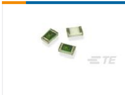
TE Part #2-1879130-8 RN 0402 3K32 0.1% 10PPM CUT LENGTH