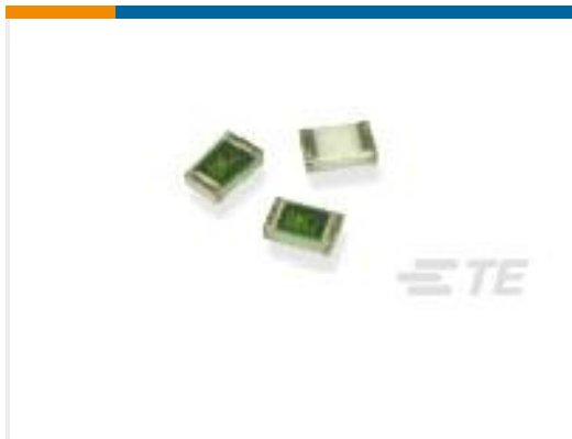
TE Part #9-1879131-1 RN 0402 12K1 0.1% 10PPM CUT LENGTH