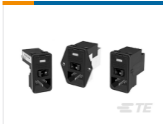
TE Part #4-6609952-8 CORCOM P SERIES MULTI-FUNCTION INLET FIL