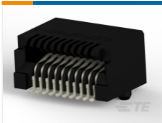
TE Part #1888247-1 SFP Connectors