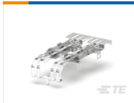
TE Part #1761011-3 SFP 1X2 LIGHT PIPE ASSY