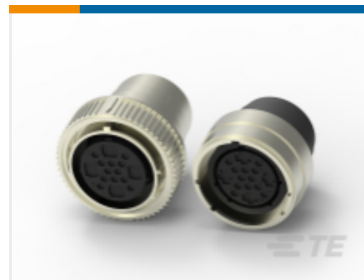
TE Part #1776088-1 CMC SERIES 4