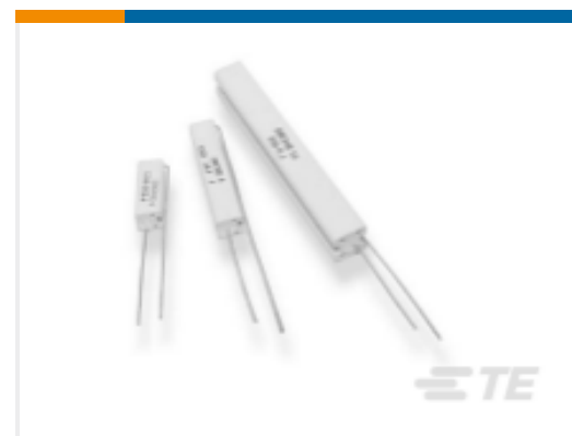
TE Part #1623728-8 Wirewound Resistor: Vertical Mount