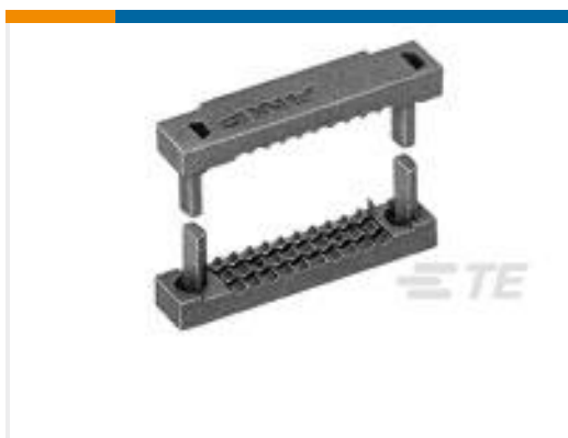
TE Part #104891-8 80 50/50 GRID CABLE RCPT COVER