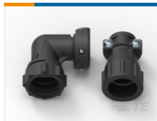
TE Part #1-206070-0 CPC CABLE CLAMPS