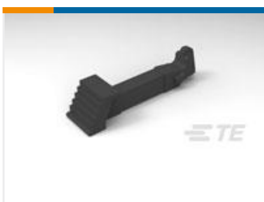
TE Part #111451-1 LATCH,UNIV I/O