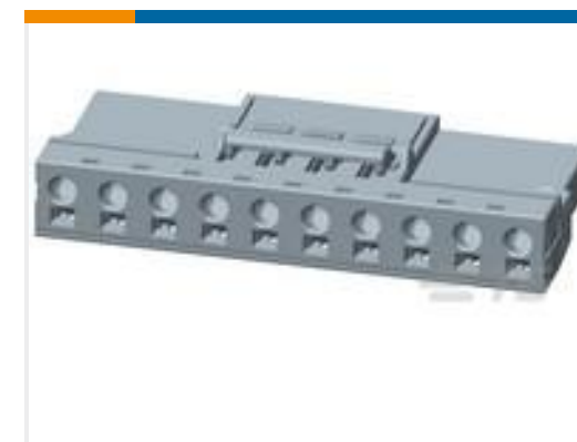
TE Part #1-2134249-0 D3900 SPRING CLAMP REC 10P w /oSEAL-typeA