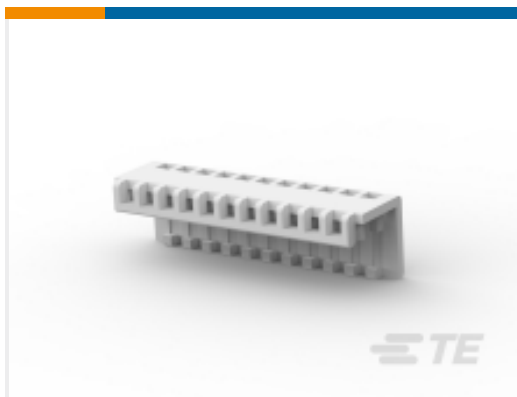
TE Part #1-643075-1 Nylon PCB Connector Covers: 2.54 mm, MTA 100