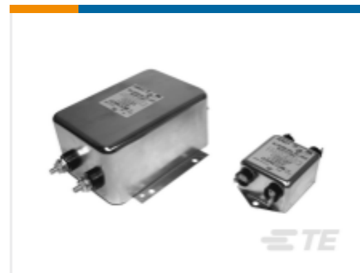
TE Part #1-6609037-8 CORCOM EMC SERIES SINGLE PHASE FILTERS