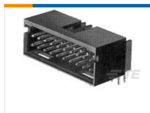
TE Part #103167-7 20 MODII HDR DRRA SHRD .100CL