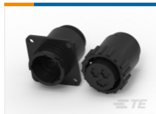
TE Part #213581-1 CPC SERIES 3