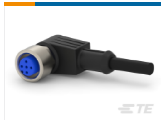
TE Part #1-2273089-3 M12 A-CODE FEMALE R/A PIGTAIL