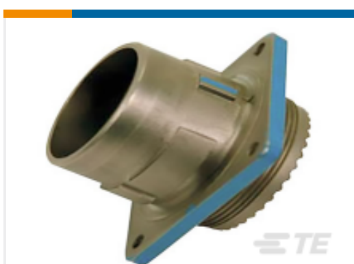
TE Part #YDIV40E17-06PNC009 RECP ASSY