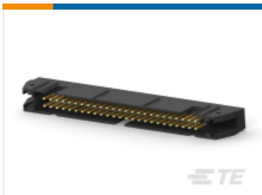
TE Part #2-5499206-4 AMP-LATCH UNIVERSAL HEADERS