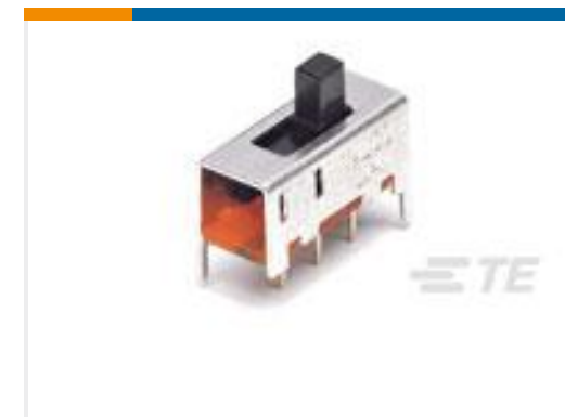
TE Part #1825257-1 MSS120004=SPDT SL SW VERT AG