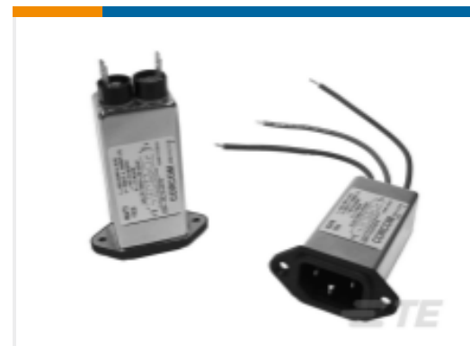
TE Part #2-6609006-4 CORCOM EJT SERIES IEC FILTERED INLETS