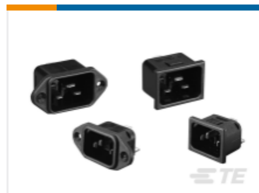
TE Part #1609133-1 CORCOM SR SERIES IEC UNFILTERED INLETS