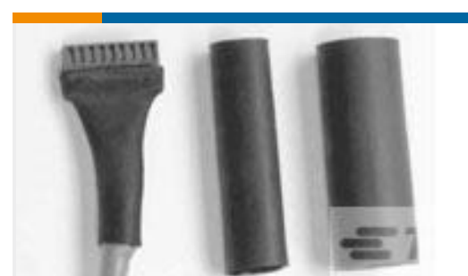
TE Part #2951512003 DWP-125-1/4-0-STK