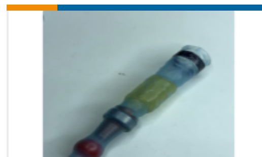
TE Part #CA6205-000 SGRS-2-58