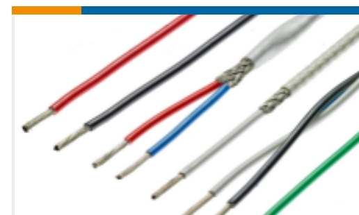
TE Part #278768-000 FLDWD0311-12-2