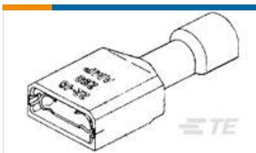
TE Part #3-350820-2 ULTRAFast 250 ASSY REC 16-14 TPBR LP