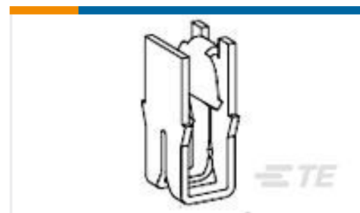
TE Part #1217690-1 SPECIAL LEAF CONTACT,300 SERIE