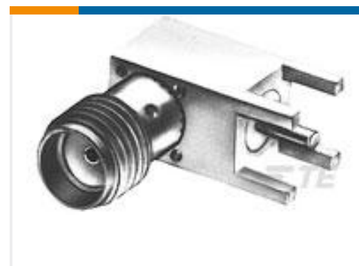
TE Part #1053400-1 2064 8003 90