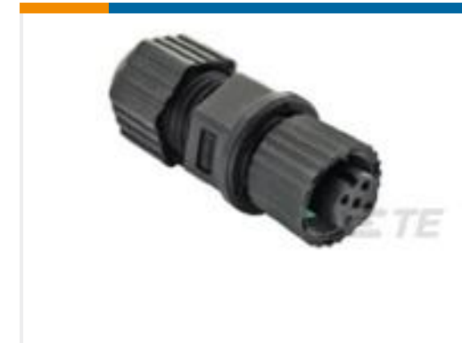
TE Part #1838274-1 M12 Fld Ser CONN. Female Skt SlDr