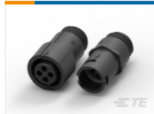
TE Part #1445389-1 MINI CPC