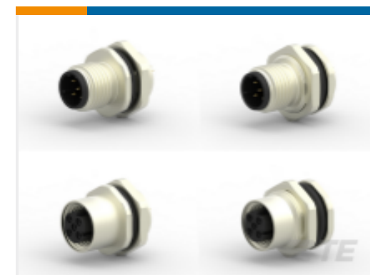
TE Part #T4130012041-000 M12 Panel Mount Solder Cups