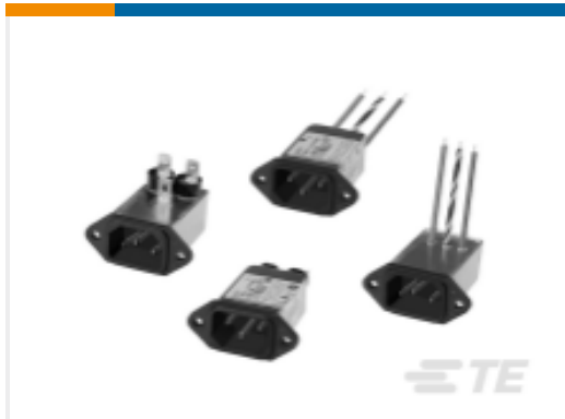
TE Part #1-6609017-3 CORCOM EC SERIES IEC FILTERED INLETS