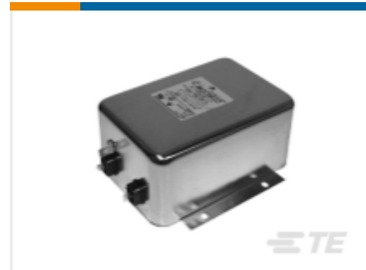
TE Part #1-6609046-1 CORCOM T SERIES SINGLE PHASE FILTERS