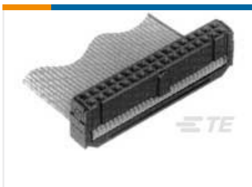
TE Part #1-1658622-2 64 NOVO MIL/CTR 30DP, LEAD FREE