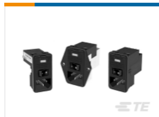
TE Part #1-6609104-5 CORCOM P SERIES MULTI-FUNCTION INLET FIL