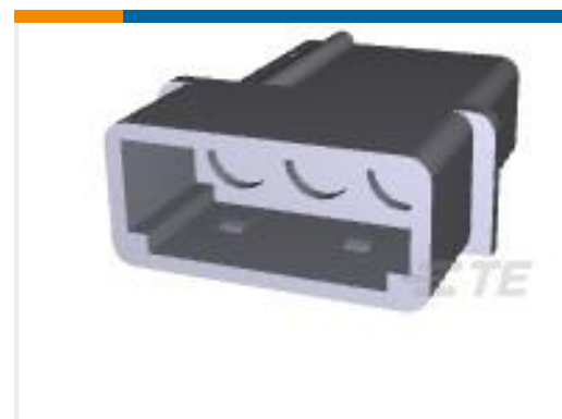
TE Part #1-480305-2 03P CMNL CAP HSG F/H RED