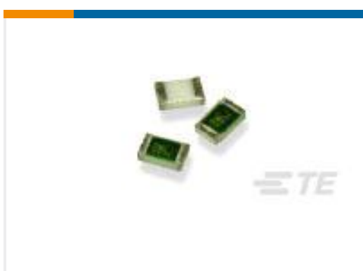
TE Part #9-1879208-0 CPF 0402 51K 0.1% 25PPM 1K RL