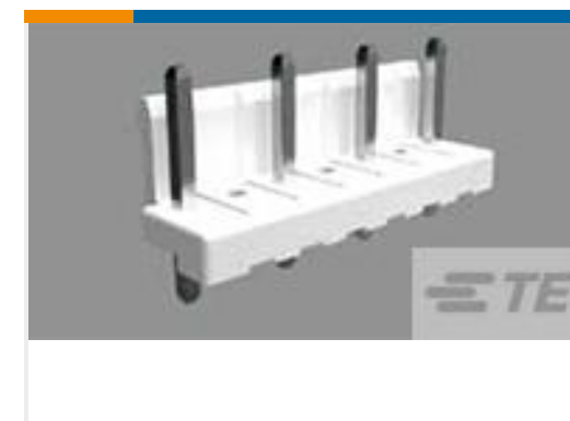
TE Part #1-1123724-3 3.96EP HDR ASSY 3(5)P NATURAL