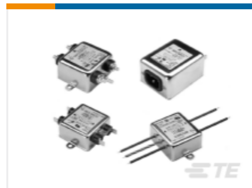
TE Part #1-6609028-7 CORCOM K SERIES SINGLE PHASE FILTERS