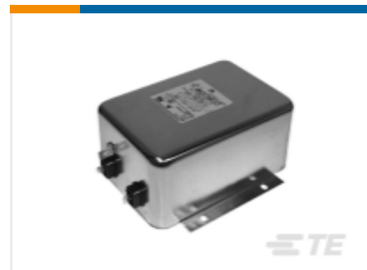
TE Part #1-6609046-1 CORCOM T SERIES SINGLE PHASE FILTERS