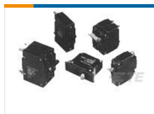
TE Part #1-1393253-7 W68-X2Q110-10=M6/M7/M9/W6/W7