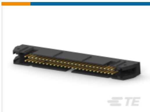
TE Part #1-5102321-0 AMP-LATCH UNIVERSAL HEADERS