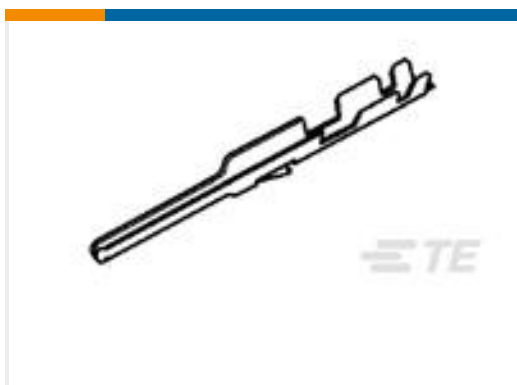
TE Part #102095-4 MOD IV PIN PLTD SN