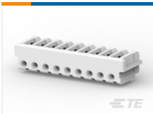
TE Part #179228-6 AMP COMMON TERMINATION HOUSINGS