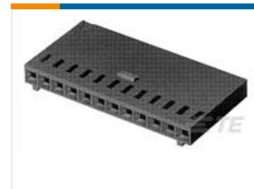
TE Part #102241-5 07 MODIV HSG COMP SR .100 POL