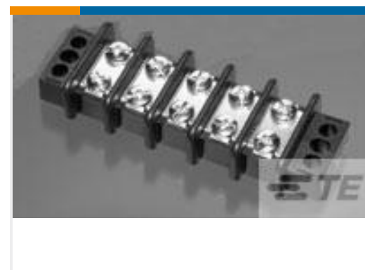
TE Part #1546310-6 6P .563" DR BARRIER STRIP