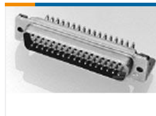
TE Part #1218435-2 R/A RCP ASSY 15 POS SER 109