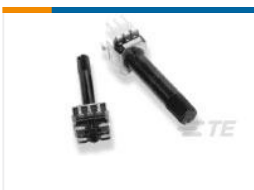
TE Part #1-1624231-2 PC610H 5KA 15SL(RoHS)