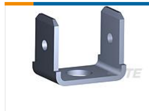
TE Part #141878-2 250 FASTON,TAB,TPBR