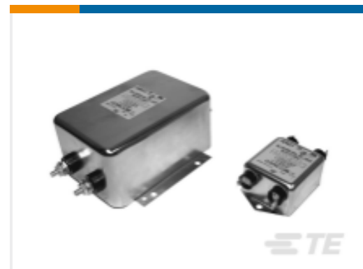
TE Part #1-6609037-1 CORCOM EMC SERIES SINGLE PHASE FILTERS