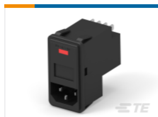
TE Part #1-6609952-5 PS00XDSX0=C4529