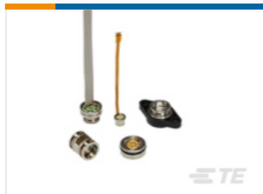
TE Part #154N-015G-R MEDIA ISOLATED PRESSURE STOCK LIST