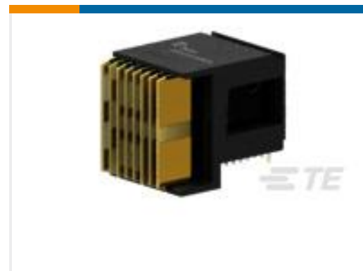
TE Part #1410189-3 MULTIGIG RT T2 7RW H-LFT,ET2