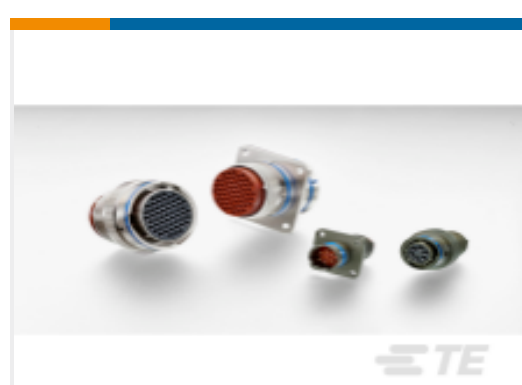
TE Part #YAFD57-14-12SNC012 PLUG ASSY