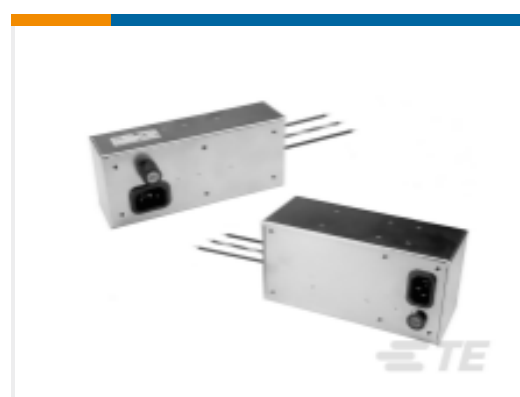
TE Part # CAT-C8114-AQ1 CORCOM AQ SERIES SINGLE PHASE FILTERS