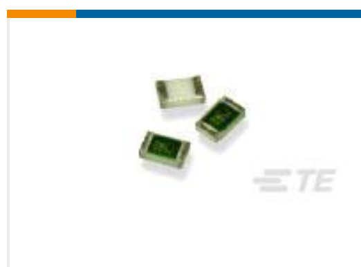
TE Part #1614881-1 CPF0603 10K 0.1% 25PPM 5K RL