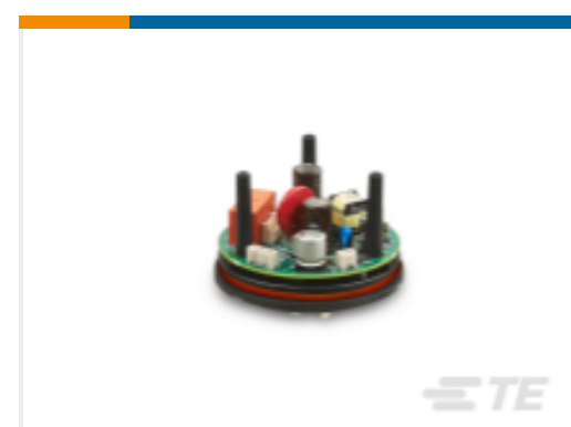
TE Part #1-2314786-1 LUMAWISE N ENHANCED BASE, FM ON, ZC YES