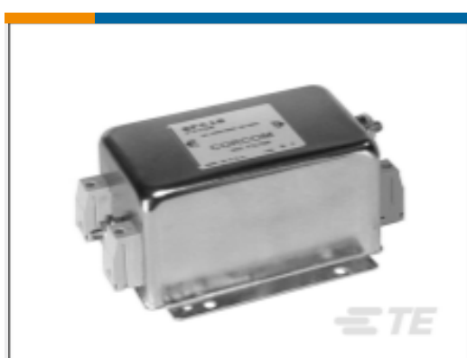
TE Part # CAT-C8114-F299B CORCOM FC SERIES SINGLE PHASE FILTERS