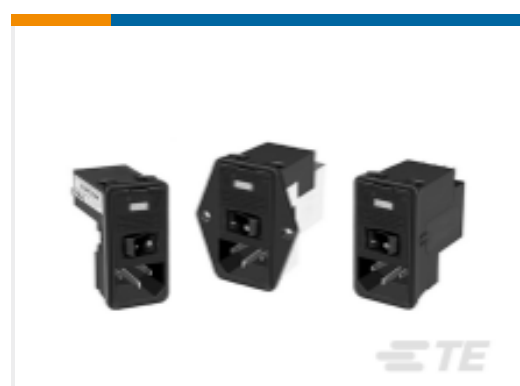
TE Part #1-6609106-4 CORCOM P SERIES MULTI- FUNCTION INLET FIL