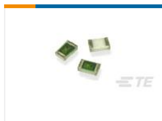
TE Part #1879129-5 RN 0402 1K24 0.1% 10PPM 1K RL