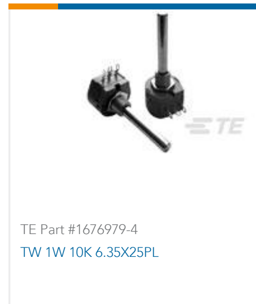
TE Part #1676979-4 TW 1W 10K 6.35X25PL