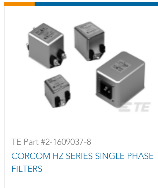
TE Part #2-1609037-8 CORCOM HZ SERIES SINGLE PHASE FILTERS