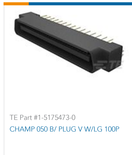
TE Part #1-5175473-0 CHAMP 050 B/ PLUG V W/LG 100P