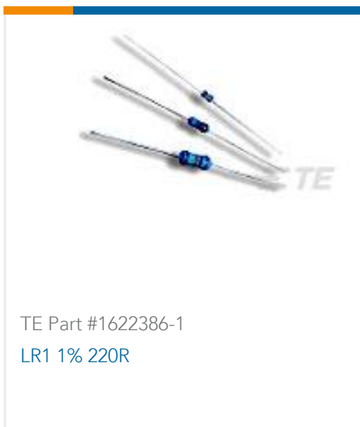
TE Part #1622386-1 LR1 1% 220R