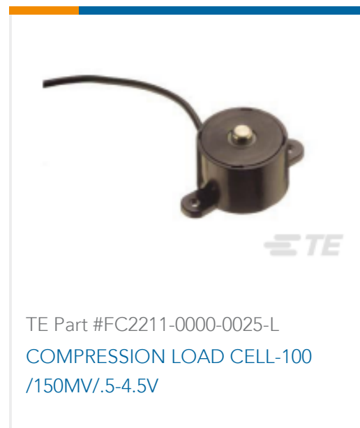
TE Part #FC2211-0000-0025-L COMPRESSION LOAD CELL-100 /150MV/.5-4.5V