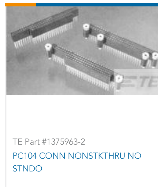
TE Part #1375963-2 PC104 CONN NONSTKTHRU NO STNDO