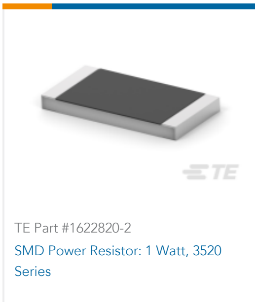
TE Part #1622820-2 SMD Power Resistor: 1 Watt, 3520 Series