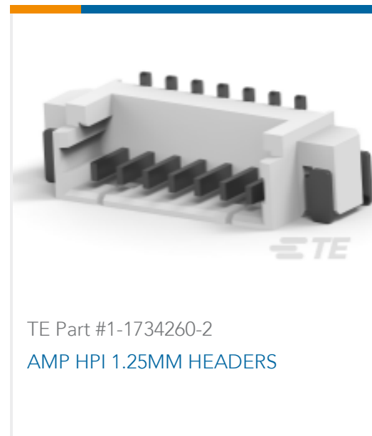
TE Part #1-1734260-2 AMP HPI 1.25MM HEADERS