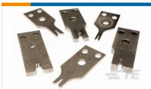
TE Part #2-456409-0 CRIMPER, WIRE .120 "F"