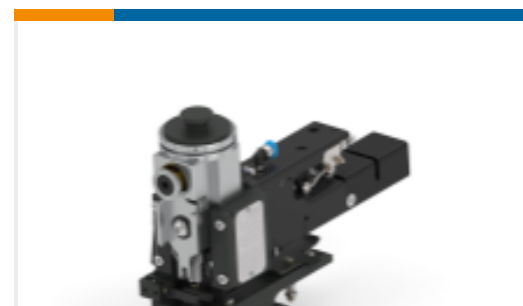
TE Part #2150911-1 OCEAN_2.0_Applicator-E-130F180F