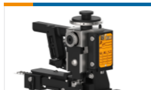
TE Part #2266652-1 OCEAN-2.0-APPLICATOR-S-063F110F