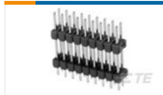
TE Part #146510-3 06 MODII HDR DRST UNSHRD STKG