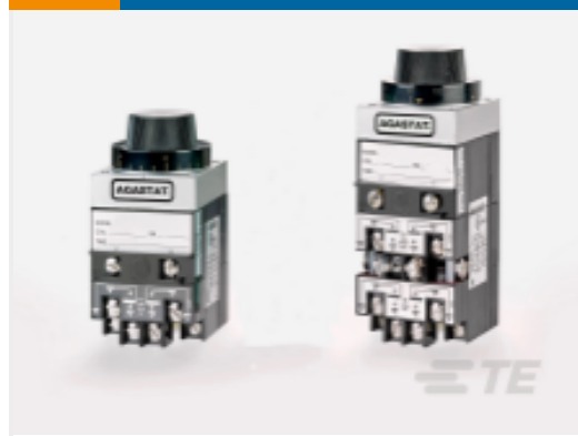
TE Part #4-1472973-2 7012OBL1=RLY, STD, ON, 2P, 24VDC, 5SEC, OPT L