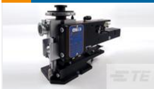
TE Part #2150289-2 OCEAN_2.0_Applicator-E-048F062O