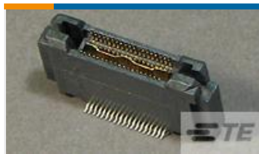
TE Part #5767120-1 MICT, 495PLG, 038, ASY, .025, AUPLT