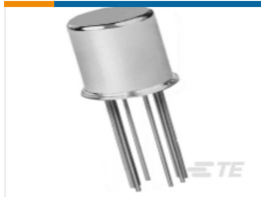
TE Part #5-1617543-9 JMSP-5XP=M39016/11-018P