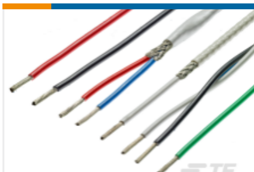
TE Part #386919-000 44A0121-22-9/95