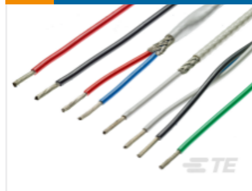
TE Part #386917-000 44A0121-22-9/93