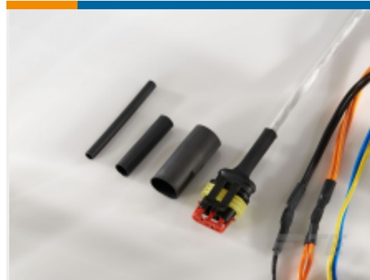
TE Part #EH2299-000 DWFR-24/6-0-STK