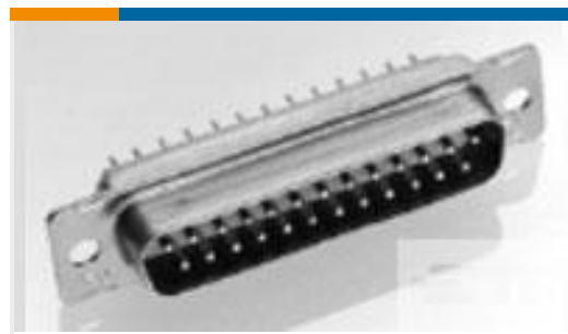
TE Part #1757819-8 AMPLIMITE,ASY,PLUG,STD,109,ZN,3, CT