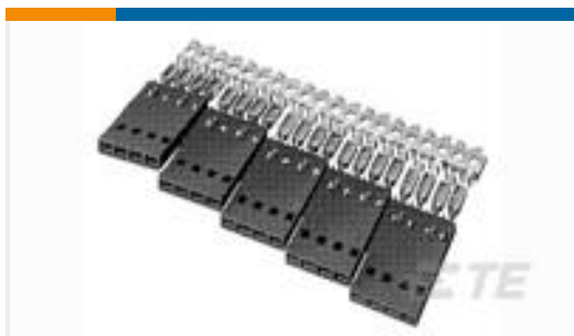
TE Part #103970-1 10X2 MTE RCPT SR RIBBED .100CL