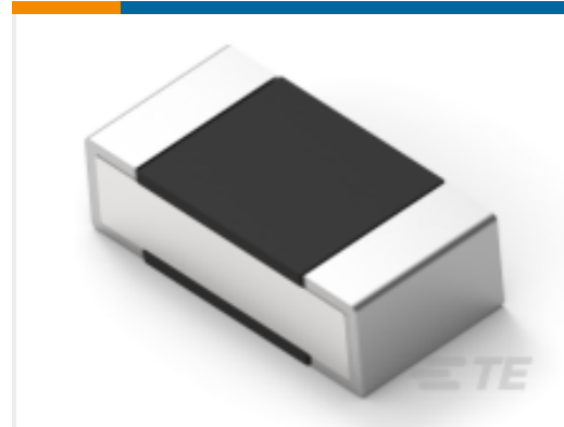
TE Part #1-2176304-8 RP 1E 0.1W 15R 0.1% 25PPM 5K RL