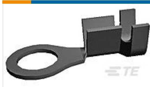
TE Part #160181-2 RING TONGUE IS 3.1-5.3 MM2 TPBR