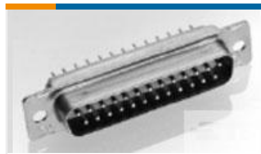
TE Part #1-1757819-0 AMPLIMITE,ASY,PLUG,STD,109,ZN,5, CT