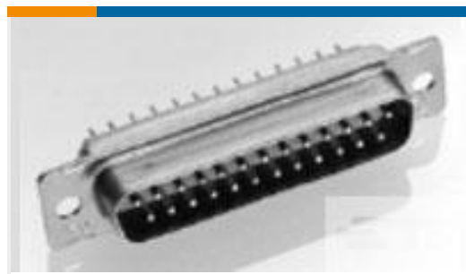
TE Part #1-1757820-0 AMPLIMITE,ASY,RCPT,STD,109,ZN,5, CT