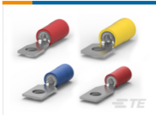
TE Part #2-327960-1 PIDG RECTANGULAR TONGUE TERMINALS