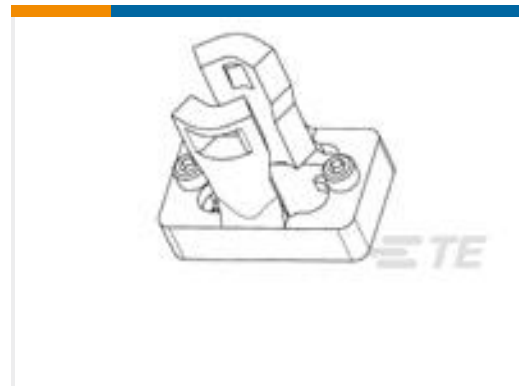
TE Part #1604905-1 KIT, BACKSHELL, 2 POS, RCPT