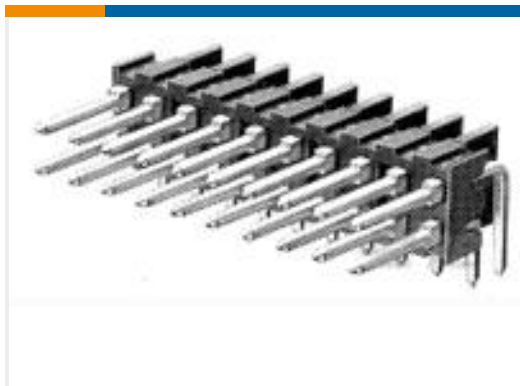
TE Part #1-86479-6 08 MODII HDR DRRR UNSHRD .100