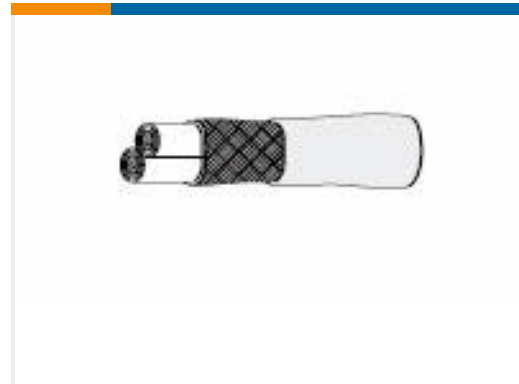
TE Part #162927-000 55A1121-16-9/96-9CS2275