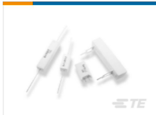
TE Part #1-1623793-2 Wirewound Resistor: Horizontal Mount