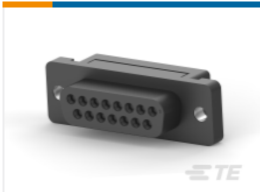
TE Part #1658612-3 IDC D-Sub: Receptacle Assembly, Low Profile, Signal, 2.77 mm