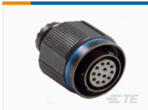
TE Part #YDTS26Z17-35PNV001 D38999: Straight Plug, 17-35 Insert