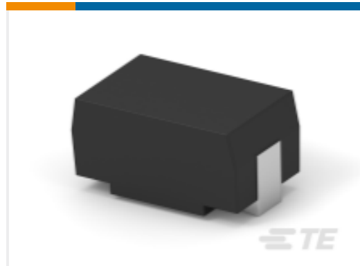
TE Part #1-1879234-7 SMD Power Resistor: 7 Watt, 200-2M Ohm