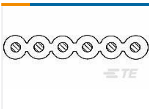
TE Part #1-57131-7 AMP 1-57131-7 Rev. M