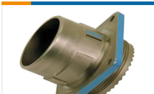
TE Part #YDIV46E23-21SNV001 PLUG ASSY