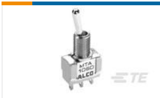
TE Part #1-1437558-6 MTA106G=(MSTA) SWITCH TOGGLE S