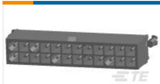
TE Part #1-794072-1 24P MINI UMNL HDR W/DH AU LF