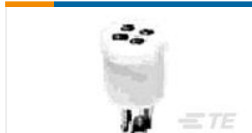
TE Part #1-1437504-9 8060-1G5=GOLD TRANSISTOR SOCKE