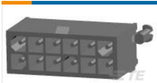
TE Part #1-794066-1 12P MINI UMNL HDR W/DH AU LF