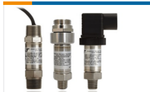
TE Part #11105666-00 AST4300A00050P4P1000:CTO-13000000-03