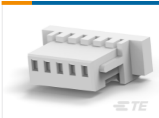
TE Part #1470364-7 AMP HPI 1.0MM RECEPTACLE HOUSINGS