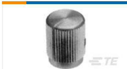
TE Part #1437622-7 KLN900B1/4=KNOB KNURL W/IND LI