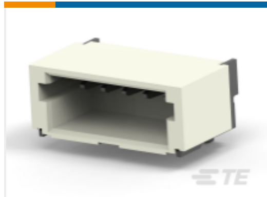
TE Part #1734709-7 AMP HPI 1.0MM HEADERS