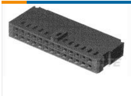
TE Part #102387-4 20 MODIV HSG COMP DR .100 POL