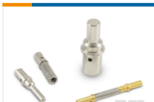
TE Part #0462-201-1631 DEUTSCH SOLID CONTACTS