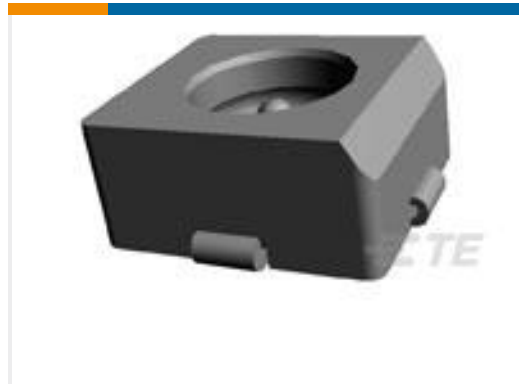
TE Part #1055688-1 2367 5001 54, VERT PLUG