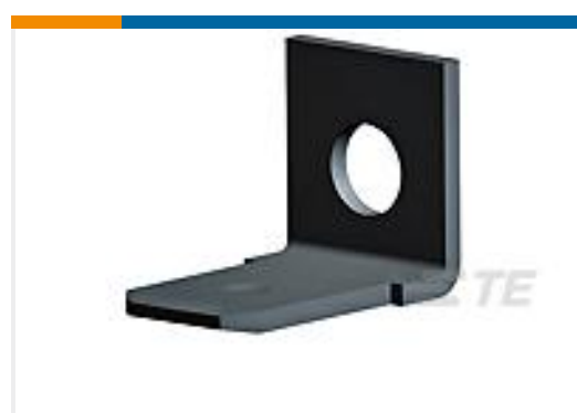
TE Part #141879-1 250 FASTON,TAB,BR