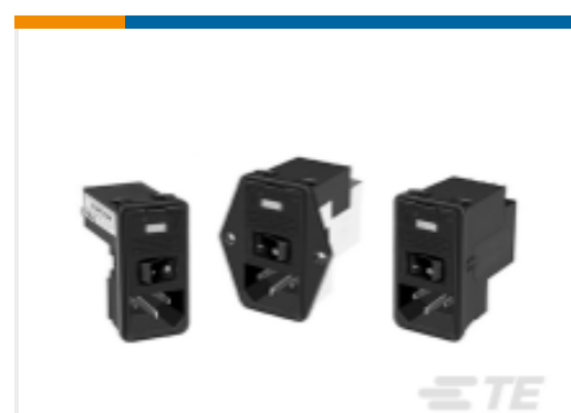
TE Part #1-6609107-8 CORCOM P SERIES MULTI- FUNCTION INLET FIL