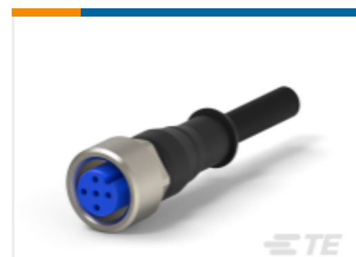
TE Part #1-2273035-2 M12 A-CODE FEMALE STRAIGHT PIGTAIL