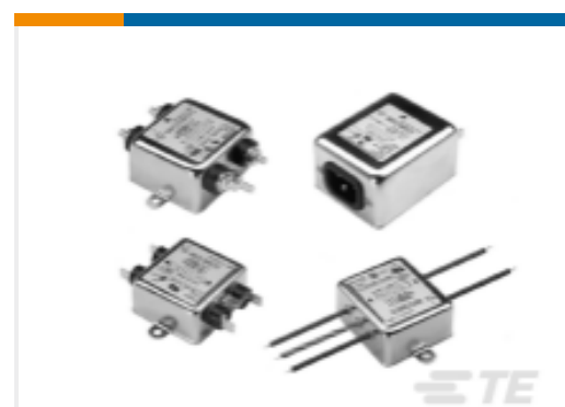
TE Part #1-6609028-7 CORCOM K SERIES SINGLE PHASE FILTERS