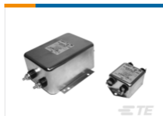
TE Part #1-6609037-5 CORCOM EMC SERIES SINGLE PHASE FILTERS