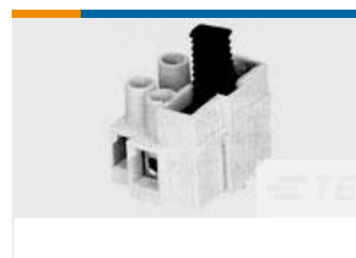
TE Part #1-1776301-0 503SI05DS=EUROPA T/B,FUSE,10MM