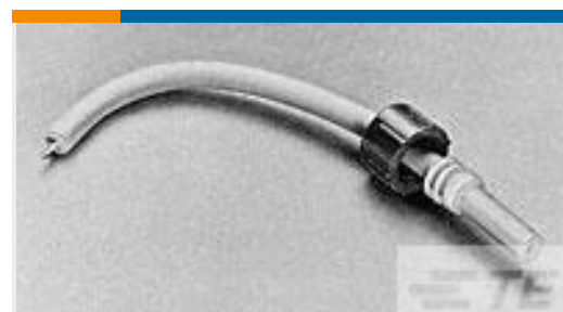
TE Part #1-846290-1 LGH-4 LEAD ELECT SGL MLD END