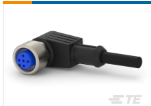
TE Part #1-2273099-2 M12 A-CODE FEMALE R/A PIGTAIL