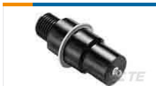
TE Part #1-5849587-9 RECEPTACLE