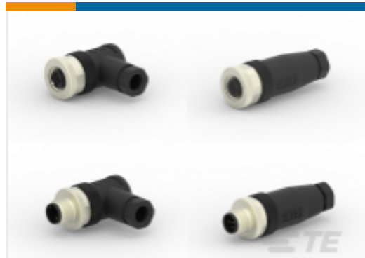
TE Part #T4111001051-000 M12 Field Installable Unshielded