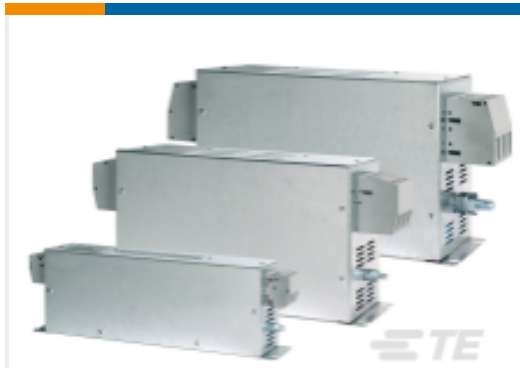
TE Part #1609989-3 CORCOM BCF SERIES 3-PHASE FILTERS