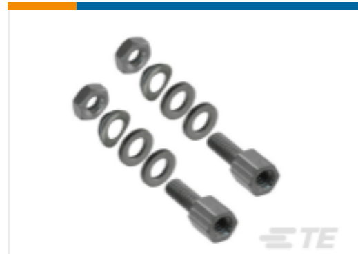
TE Part #1-1393560-8 V42254A 122V 1=SUB D BOLZENZA