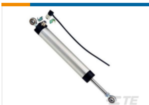
TE Part #04-1270-0003 CLWG-225-NC4