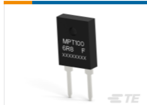
TE Part #6-2176429-4 MPT100 560R 1%