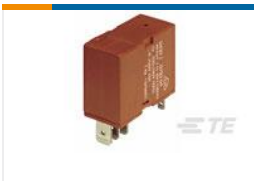
TE Part #1-1415430-4 0430 05 2701 00