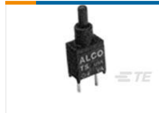
TE Part #1571990-1 TSPD11CGPC004