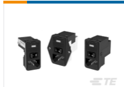
TE Part #6609951-9 CORCOM P SERIES MULTI- FUNCTION INLET FIL