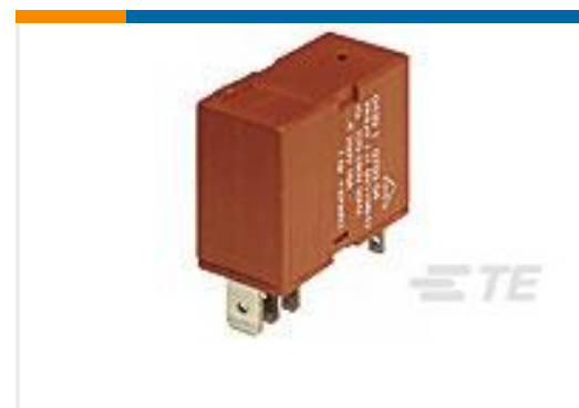
TE Part #2-1415539-5 043005260100