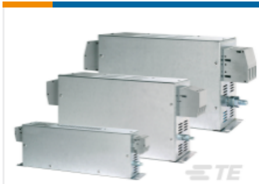
TE Part #1609989-8 CORCOM BCF SERIES 3-PHASE FILTERS