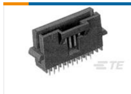
TE Part #5-146085-1 10 SYSTEM 50 HDR SRST SHRD SN