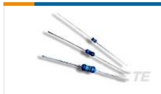
TE Part #1622767-1 LR2 1% 5K6