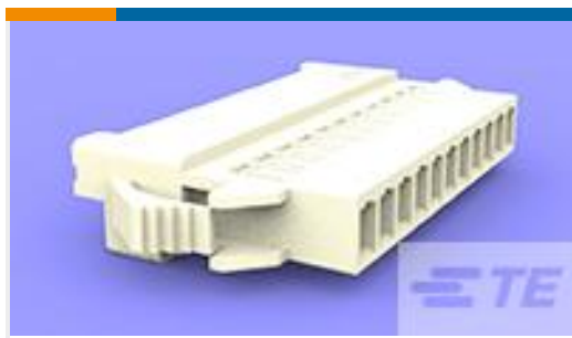
TE Part #1969590-8 HSG, REC, PANEL MOUNT, SINGLE ROW, EP2.5