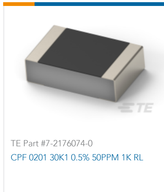
TE Part #7-2176074-0 CPF 0201 30K1 0.5% 50PPM 1K RL