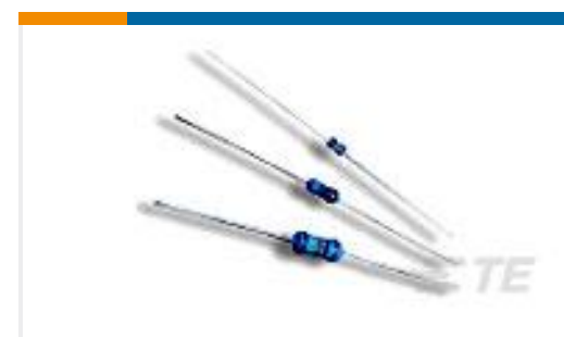
TE Part #1614998-1 LR0204 1% 13R