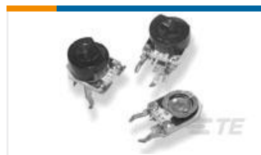
TE Part #1-1623895-3 416X 500K