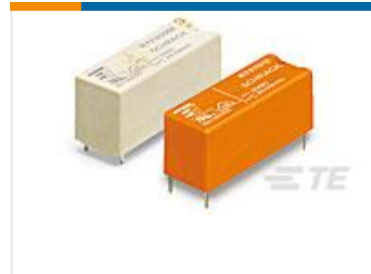
TE Part #6-1393224-1 RY213012