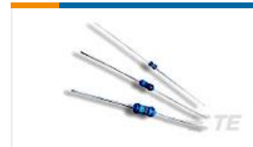
TE Part #1614998-1 LR0204 1% 13R