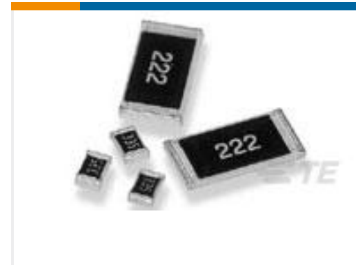
TE Part #2-1879496-5 CRGH0805 5% 120K 0.33W