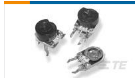
TE Part #1-1623895-2 416X 200K