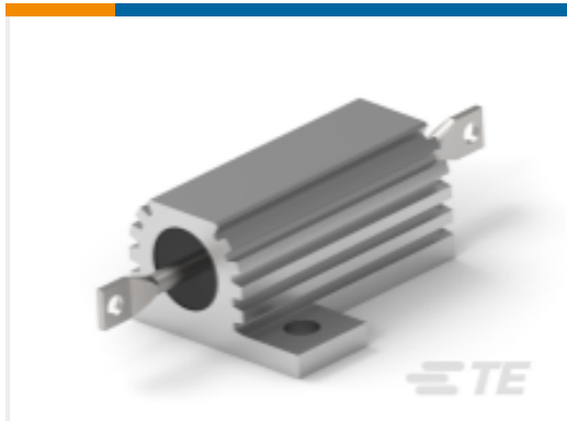
TE Part #1879363-4 Power Resistor: Aluminum Housed, 75 Watt