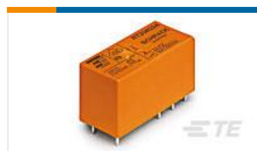
TE Part #1649329-2 RTE24006