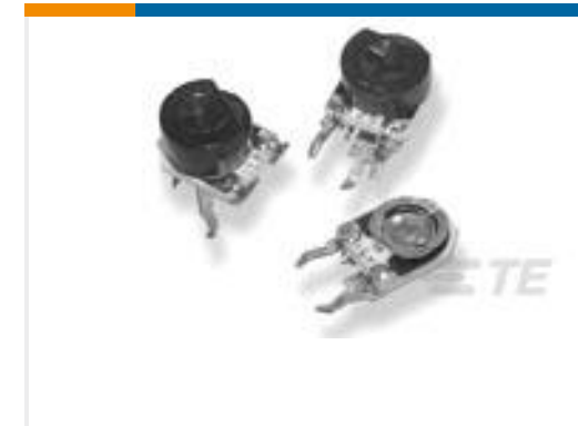
TE Part #1-1623894-3 416P 50K