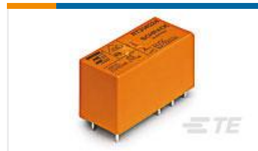
TE Part #1649329-2 RTE24006