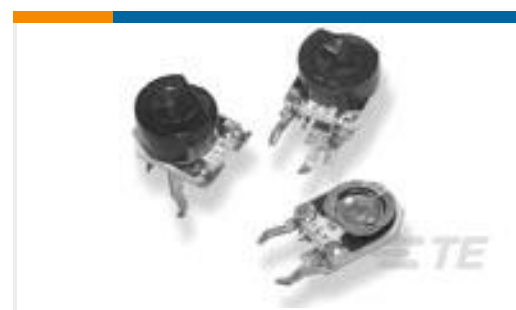
TE Part #1-1623895-3 416X 500K