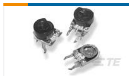
TE Part #1-1623895-2 416X 200K