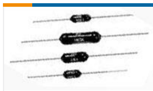
TE Part #1-1879666-9 H8 205K 0.1% 15PPM