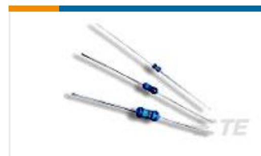
TE Part #1614998-1 LR0204 1% 13R