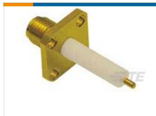
TE Part #1-1478968-0 SMA PNL SKT LNCH STUB 4/FLNG GSS NCC