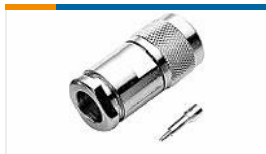
TE Part #1-1478420-0 N Str Plg PS 50Ohm Silver Pltd PSF1 /4M,