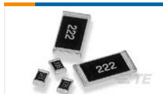
TE Part #1625873-6 RS 1206 RESISTOR KIT