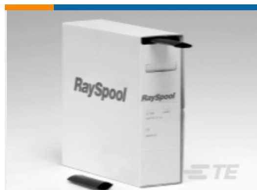
TE Part #907279-000 CGPT-R-KIT-2