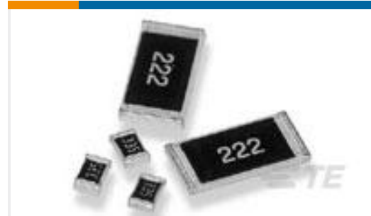
TE Part # 1625873-4 0805 RESISTOR KITS