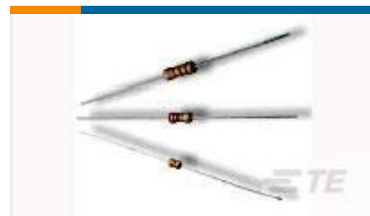
TE Part #1625873-7 RS CFR16 RESISTOR KIT