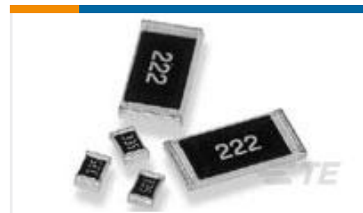
TE Part # 1-1625873-4 RS 0402 1% RESISTOR KIT