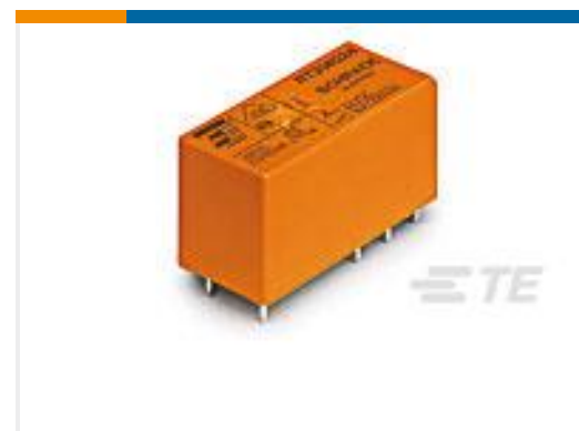
TE Part #1-1649357-3 RTH34012