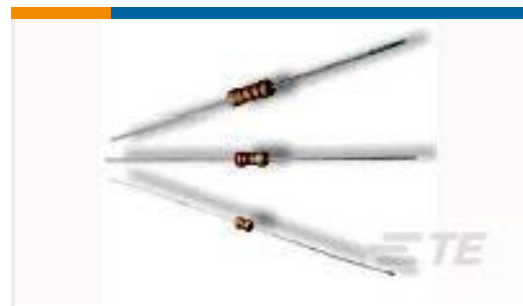
TE Part # 1625873-9 RS CFR50 RESISTOR KIT