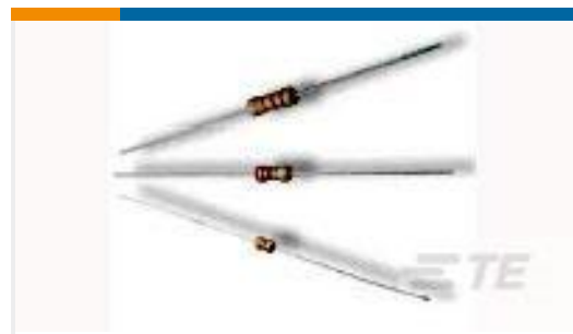
TE Part # 1625873-7 RS CFR16 RESISTOR KIT