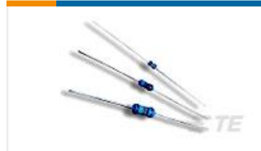
TE Part # 1-1625873-2 RS LR2 RESISTOR KIT