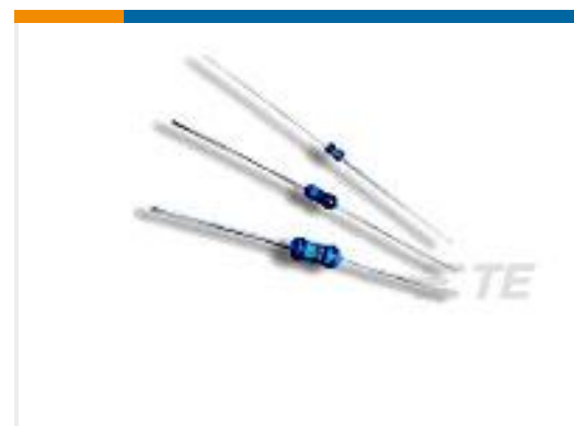
TE Part #1-1625873-1 RS LR1 RESISTOR KIT