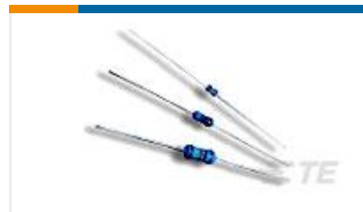
TE Part # 1-1625873-1 RS LR1 RESISTOR KIT