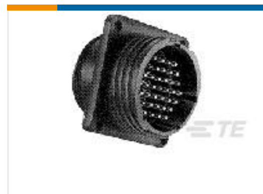
TE Part #206036-1 RECEPT, SZ 17-16 CPC