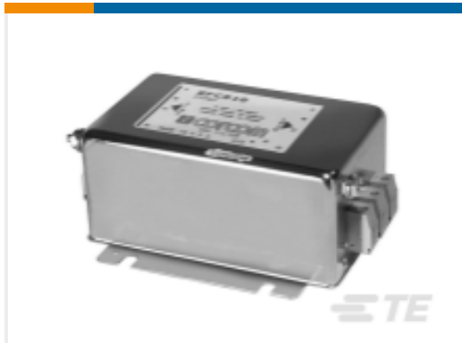
TE Part #1-6609070-0 CORCOM FCD SERIES 3-PHASE FILTERS