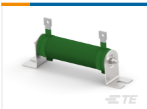
TE Part #1-1879455-1 Wirewound Resistor: Mineral, 2.5 Kw