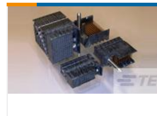
TE Part #2057435-3 IMP100S,H,V4P8C,LG,OEW39,5.5