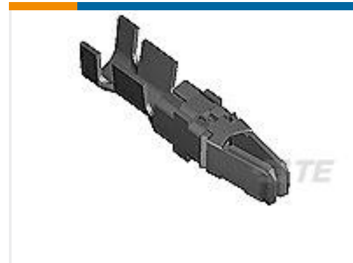
TE Part #2-66740-1 TYPE XII FEMALE CONT (LP)