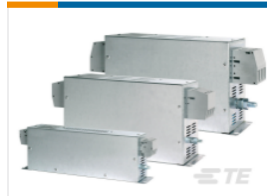
TE Part #2-1609989-6 CORCOM BCF SERIES 3-PHASE FILTERS