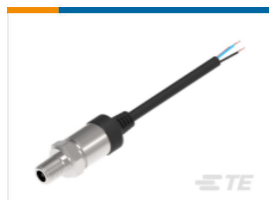
TE Part #20010080-00 PRESS XDCR M325M-000005-100PG