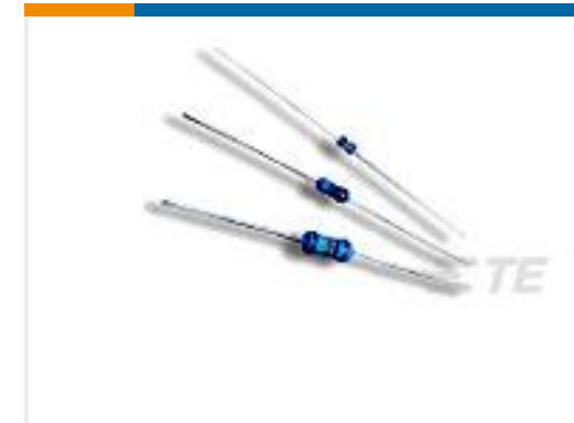
TE Part #1622768-1 LR2 1% 620K