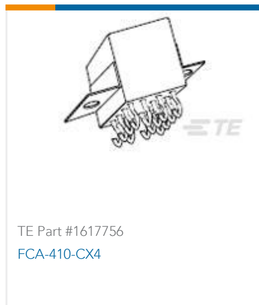
TE Part #1617756 FCA-410-CX4