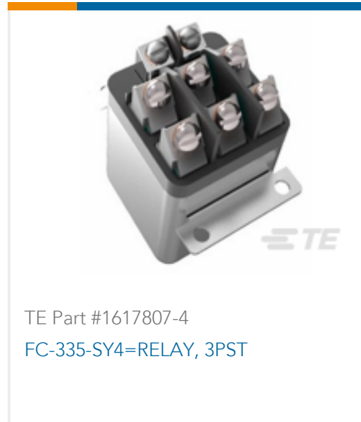
TE Part #1617807-4 FC-335-SY4=RELAY, 3PST