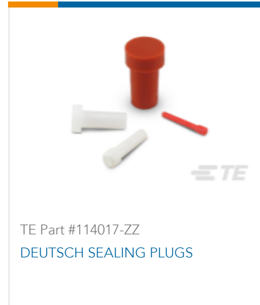
TE Part #114017-ZZ DEUTSCH SEALING PLUGS