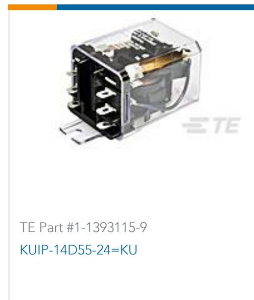
TE Part #1-1393115-9 KUIP-14D55-24=KU