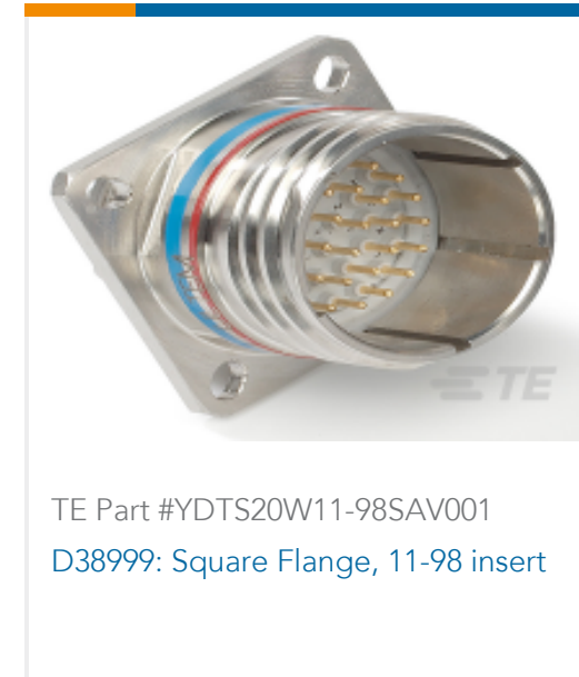
TE Part #YDTS20W11-98SAV001 D38999: Square Flange, 11-98 insert