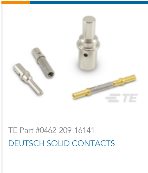
TE Part #0462-209-16141 DEUTSCH SOLID CONTACTS