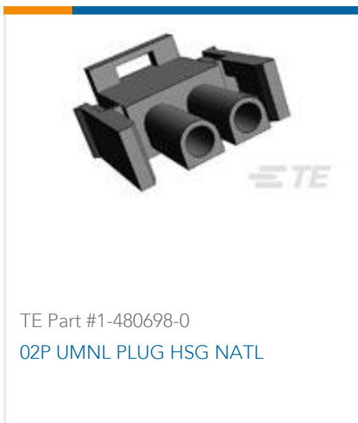
TE Part #1-480698-0 02P UMNL PLUG HSG NATL