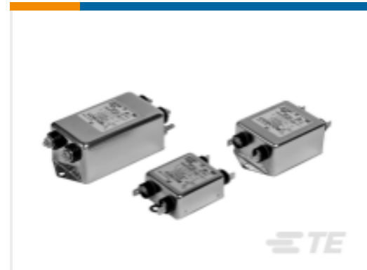
TE Part #1-1609034-8 CORCOM SB SERIES SINGLE PHASE FILTERS