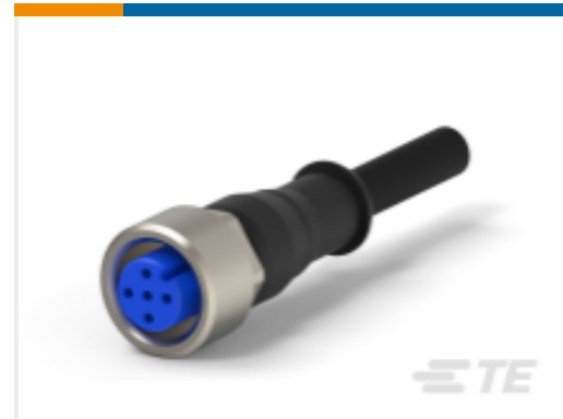
TE Part #1-2273035-2 M12 A-CODE FEMALE STRAIGHT PIGTAIL