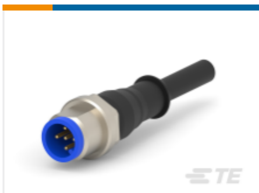
TE Part #1-2273028-3 M12 A-CODE MALE STRAIGHT PIGTAIL