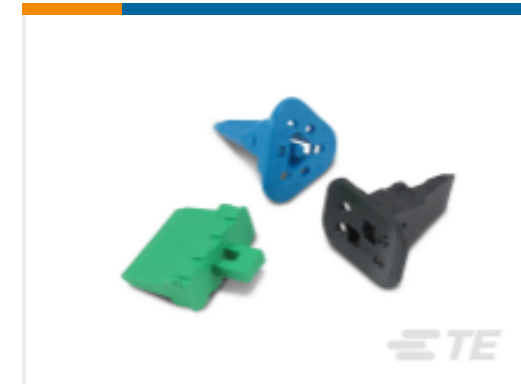
TE Part #W6P DEUTSCH DT WEDGELOCKS