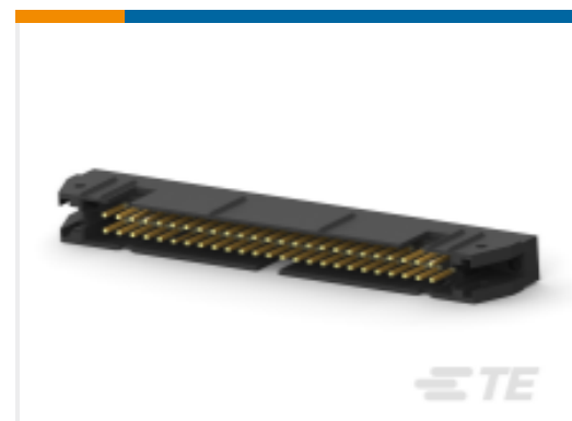
TE Part #1-499923-0 AMP-LATCH UNIVERSAL HEADERS