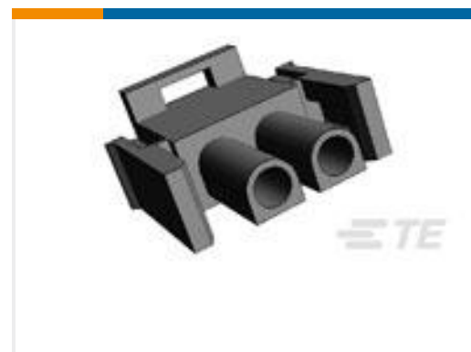
TE Part #1-480698-0 02P UMNL PLUG HSG NATL