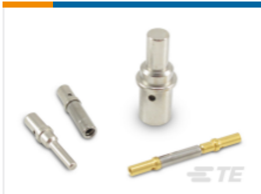
TE Part #0462-209-16141 DEUTSCH SOLID CONTACTS