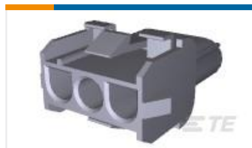
TE Part #1-480701-0 03P UMNL CAP HSG NATL