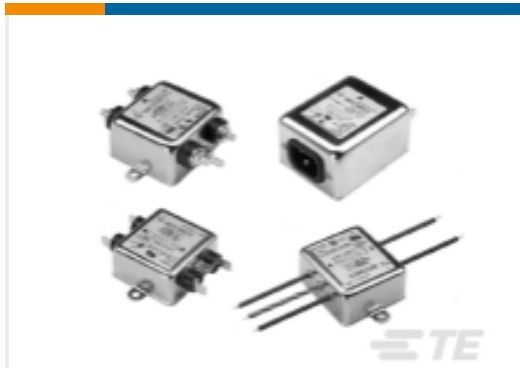
TE Part #1-6609028-9 CORCOM K SERIES SINGLE PHASE FILTERS