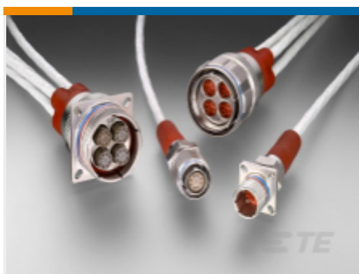
TE Part #YCFX26M2532PZA0000 PLUG ASSY