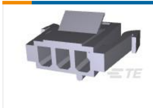
TE Part #1-480304-0 03P CMNL PLUG HSG P/M NATL