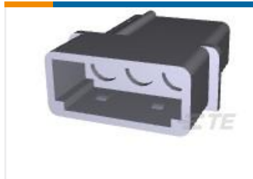
TE Part #1-480305-0 03P CMNL CAP HSG F/H NATL