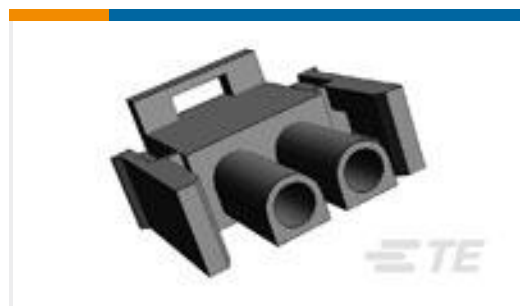
TE Part #1-480698-0 02P UMNL PLUG HSG NATL