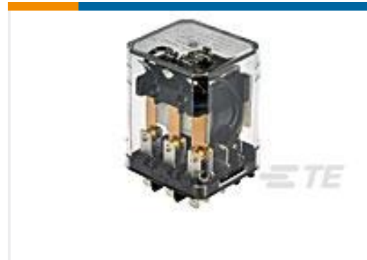
TE Part #1393118-2 KUP-14A55-24=KU