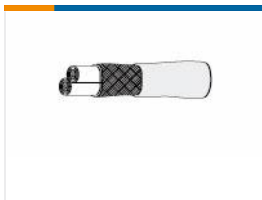
TE Part #158551-000 55A1141-18-MST4-9CS2275