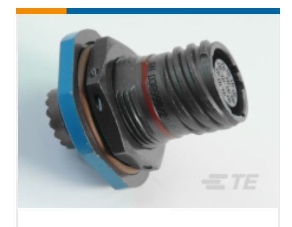
TE Part #YDTS24W13-04SBV001 Jam Nut: D38999, 13-04 Insert