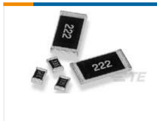
TE Part #1623252-1 CRG0805 1% 560R