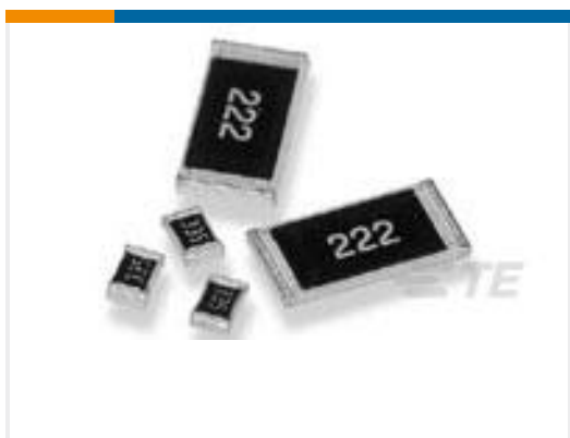
TE Part #1623107-1 CRG0805 1% 120R