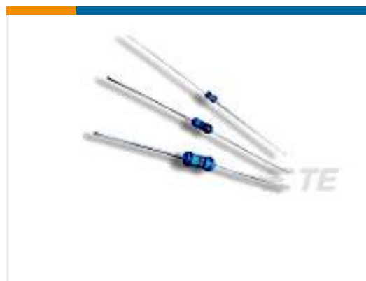
TE Part #3-1676913-9 YR1 0.1% 226R