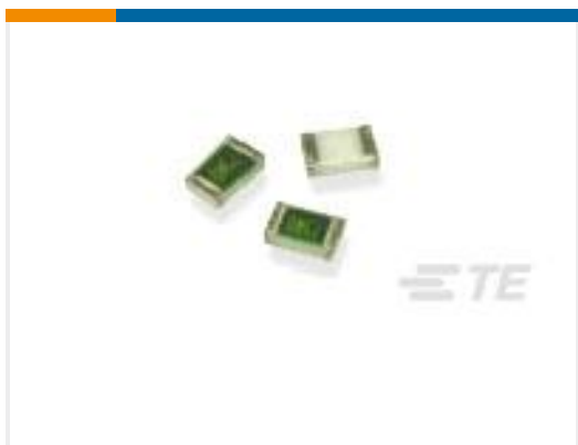
TE Part #1676142-2 RN 0805 100K 0.1% 10PPM 1KRL