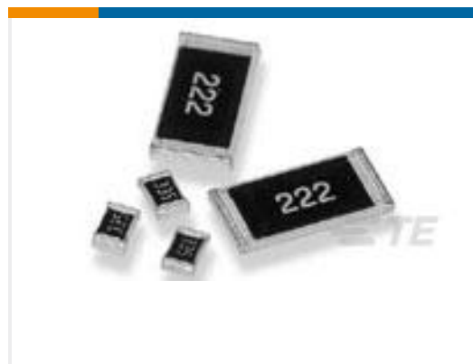
TE Part #1623156-1 CRG0805 1% 220R