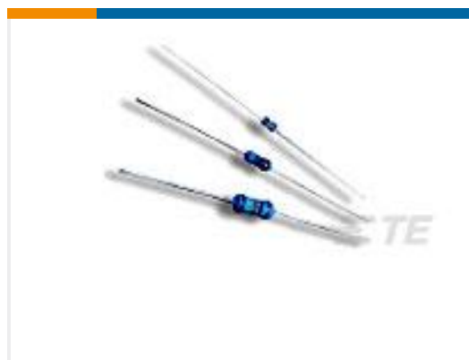
TE Part #2-1676913-4 YR1 0.1% 1K91