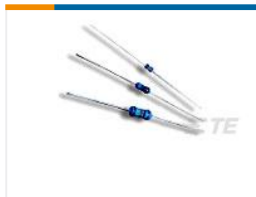
TE Part #9-1676913-0 YR1 0.1% 340R