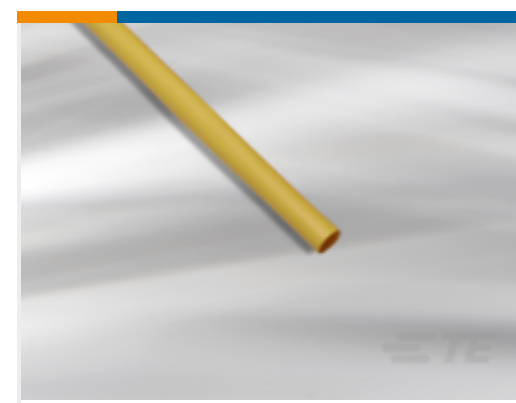
TE Part #EM63602001 Single Wall RNF-100 Reel HS Tubing