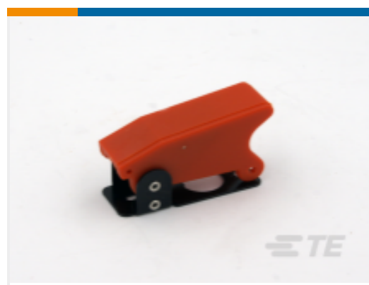
TE Part #K1127139 Flip Cover Switch Guard, 07 Toggle Switch, Feed-Through