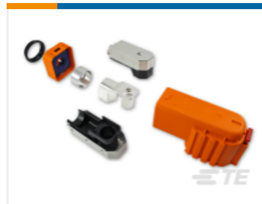
TE Part #YHVP1100-1P-90-B-0 HVP1100-1phi XE,90,Key B