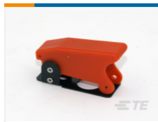
TE Part #K1041530 Flip Cover Switch Guard, 08 Toggle Switch, Feed-Through