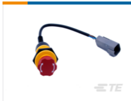
TE Part #K1160799 Emergency Stop Switch, 1 Actuator, Flush, Threaded Bushing