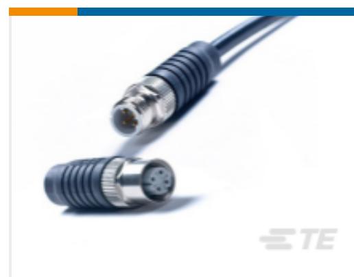
TE Part #1-2823446-4 M12 STRAIGHT CRIMPED STRAIN RELIEF