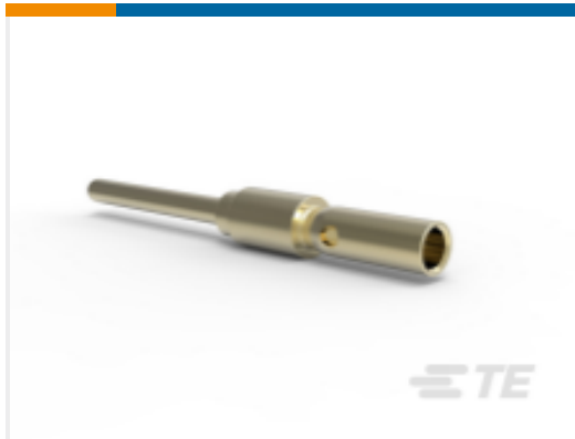
TE Part #1-2314102-1 M12 CRIMP CONTACT FOR D AND A5