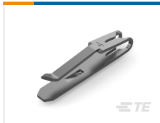
TE Part #641643-2 Connector Contact: Socket /Receptacle, Wire-to-Board / Wire-to-Wire, MTA 100