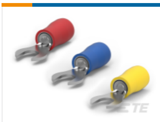
TE Part #8-35216-1 PIDG SLOTTED RING TONGUE TERMINALS