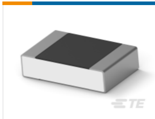
TE Part #9-2176378-0 RQ 0805 84R5 0.1% 10PPM 5K RL