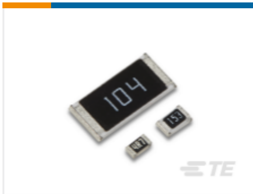
TE Part #3-2176348-9 CRGCQ 2010 2M2 5%