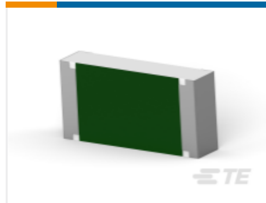
TE Part #2176399-8 3502 1K0 5%