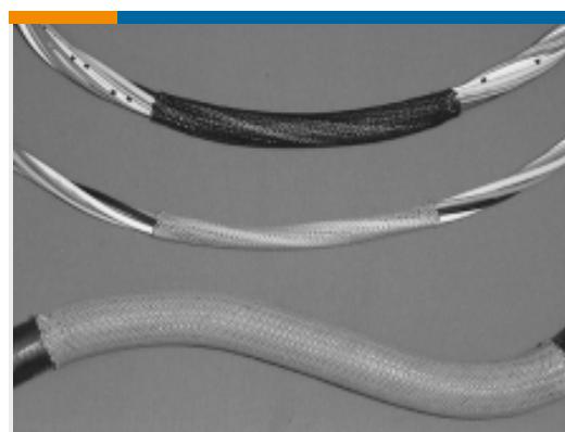
TE Part #C145614001 VERSAFLEX-03-0-SP