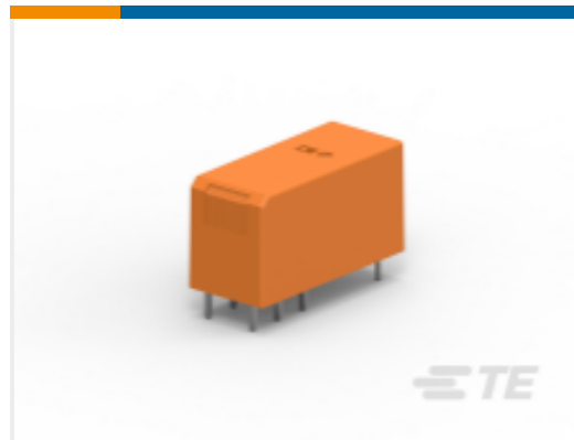
TE Part #2-1415899-0 PCB Power Relay: 12-16 Amp, Monostable