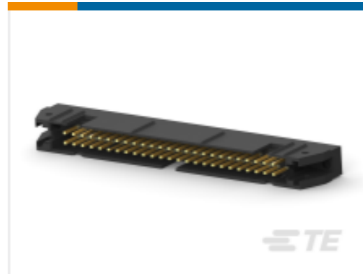
TE Part #102159-1 AMP-LATCH UNIVERSAL HEADERS