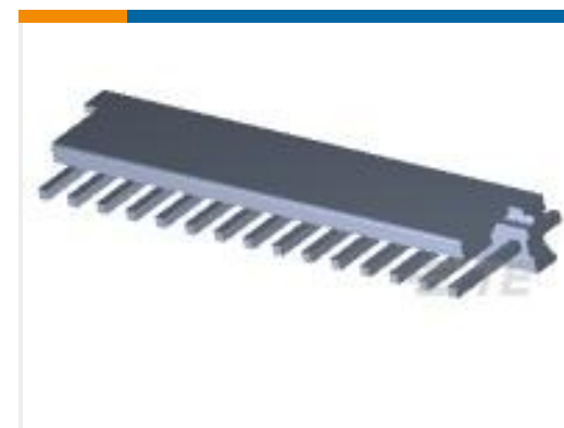
TE Part #4-641119-5 15P MTA156 HDR ASSY FL/ST LF