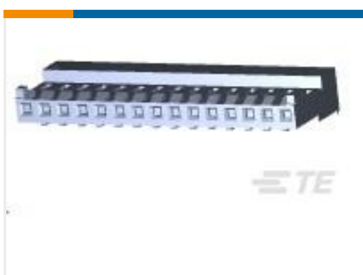
TE Part #4-644460-5 15P MTA156 CONN ASSY 18AWG ORA