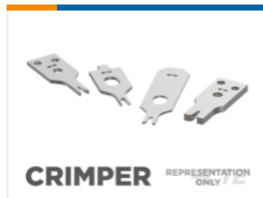
TE Part #2-1803019-1 CRIMPER, INSULATION O