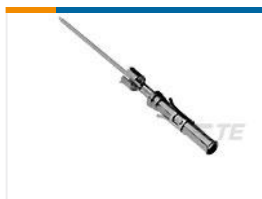
TE Part #66461-5 SKT,.062 DIA,.025 SQ POST,LP