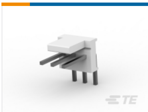
TE Part #1-640455-6 Polyester Right Angle PCB Header: 2.54mm, Wire-to-Board, MTA 100