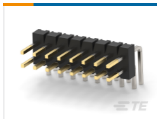
TE Part #5-146308-8 16 MODII HDR DRRA B/A .100