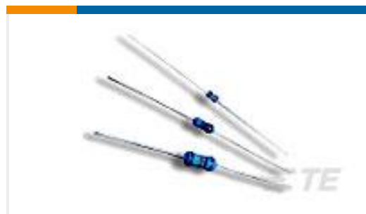
TE Part #1676914-5 YR1 0.1% 35K7