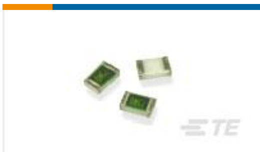
TE Part #2-2176087-7 RP 1J 0.166W 127R 0.1% 25PPM 1K RL