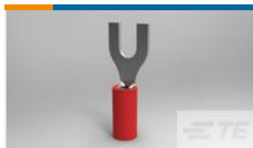
TE Part #130517 PIDG 22-16 SPADE M4