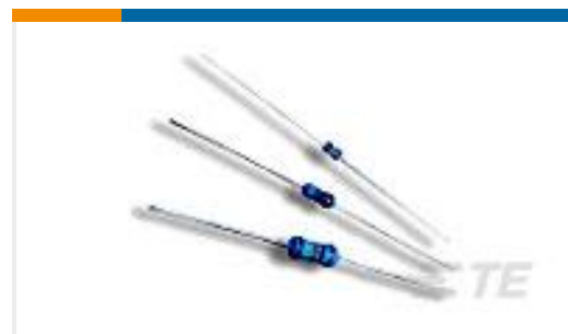
TE Part #1-1676914-3 YR1 0.1% 39K2