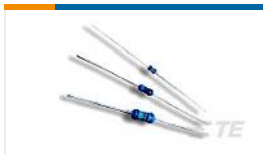
TE Part #1622381-1 LR1 1% 200R