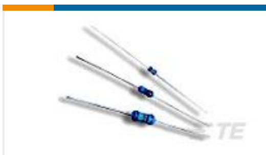
TE Part #2-1622796-9 YR1 0.1% 4K64