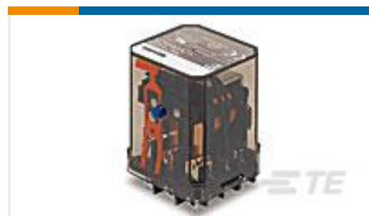
TE Part #1415542-9 RM225730