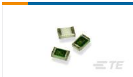
TE Part #1879336-3 CPF 0603 243R 1% 50PPM 1K RL