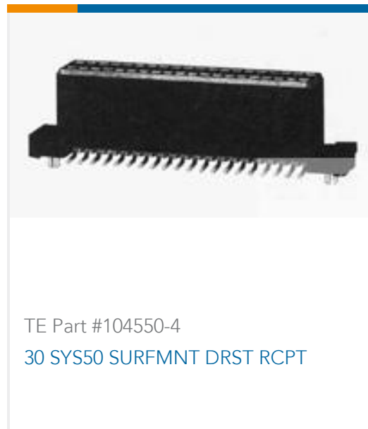
TE Part #104550-4 30 SYS50 SURFMNT DRST RCPT