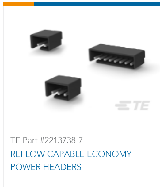
TE Part #2213738-7 REFLOW CAPABLE ECONOMY POWER HEADERS