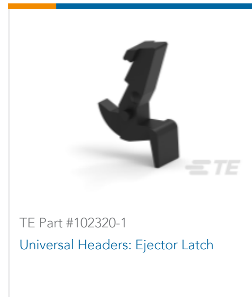
TE Part #102320-1 Universal Headers: Ejector Latch