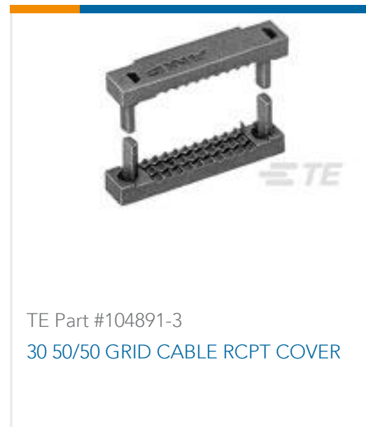
TE Part #104891-3 30 50/50 GRID CABLE RCPT COVER