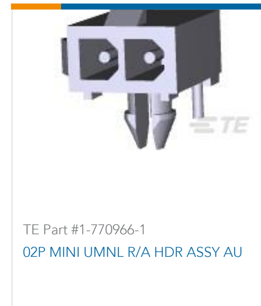
TE Part #1-770966-1 02P MINI UMNL R/A HDR ASSY AU