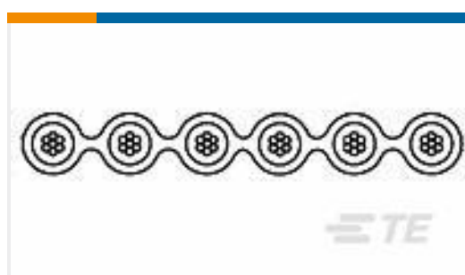
TE Part #1-57040-8 Madison Spec 100-4703 Rev. 7