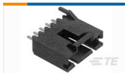
TE Part #104809-6 07 MTE HDR SRST LATCH W/HLDWN