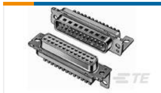
TE Part #3-1393480-3 V23529B1122C215=SUB D STIFTLEI