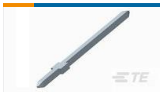
TE Part #1-928776-3 MOD2 STIFT M A-PIN