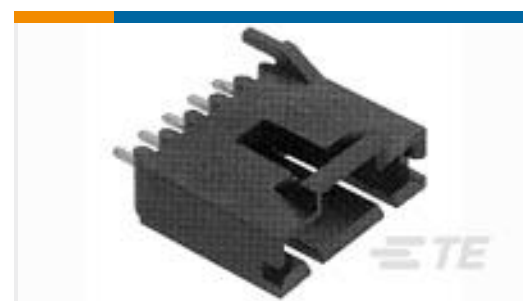
TE Part #104809-4 05 MTE HDR SRST LATCH W/HLDWN