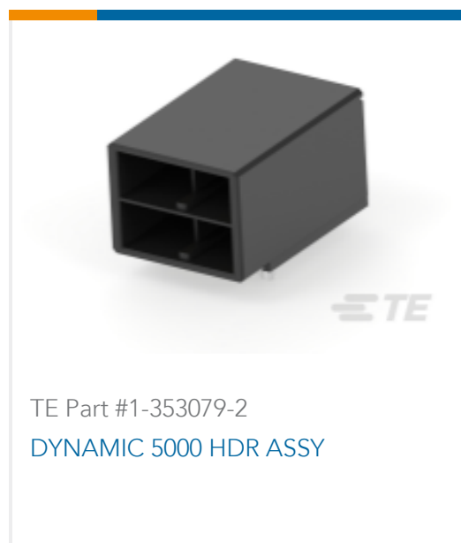
TE Part #1-353079-2 DYNAMIC 5000 HDR ASSY