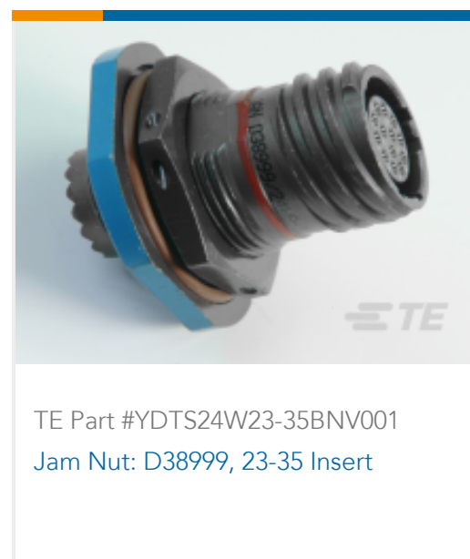
TE Part #YDTS24W23-35BNV001 Jam Nut: D38999, 23-35 Insert