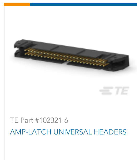
TE Part #102321-6 AMP-LATCH UNIVERSAL HEADERS