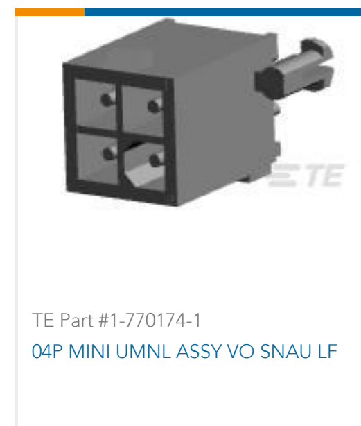
TE Part #1-770174-1 04P MINI UMNL ASSY VO SNAU LF